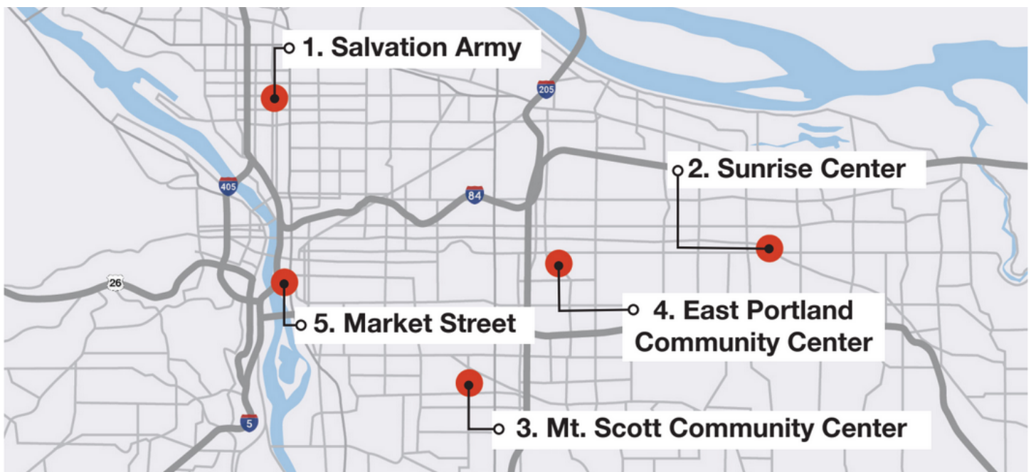
Figure 1 - Map of severe weather shelter locations

County shelters have a “no turn away” policy because of life-threatening cold temperatures and will create additional capacity during this event as needed. Severe weather shelters do not require identification or any other documentation for entry. All shelters are ADA accessible and pets are welcome at all locations. Survival kits with life-saving gear — tents, sleeping bags, warm clothing — will also be distributed as needed at each severe weather shelter site.