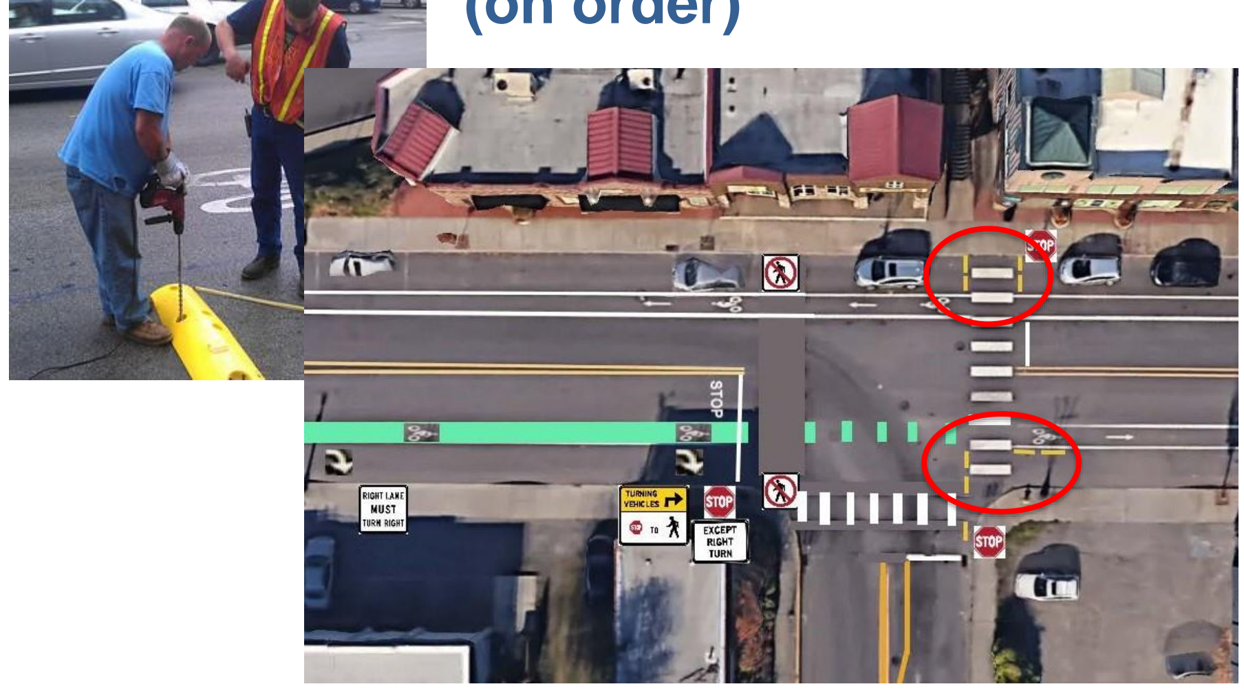
Install protective tuff curbs ( -- lines in drawing)