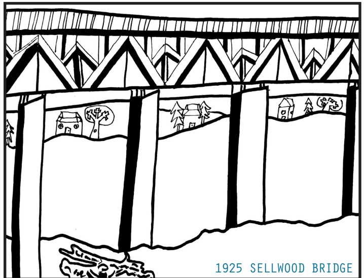
1925 SELLWOOD BRIDGE