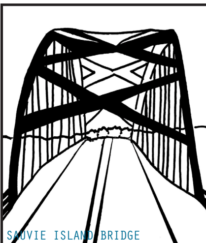
SAUVIE ISLAND BRIDGE

BIG & AWESOME BRIDGES of MULTNOMAH COUNTY ARTWORK BY STUDENTS OF THE SABIN/ACCESS ART PROJECT