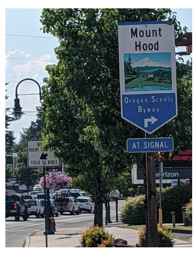
Mt. Hood Scenic Byway in Sandy, OR. Signage directs visitors from Hwy. 26 to Bluff Road.