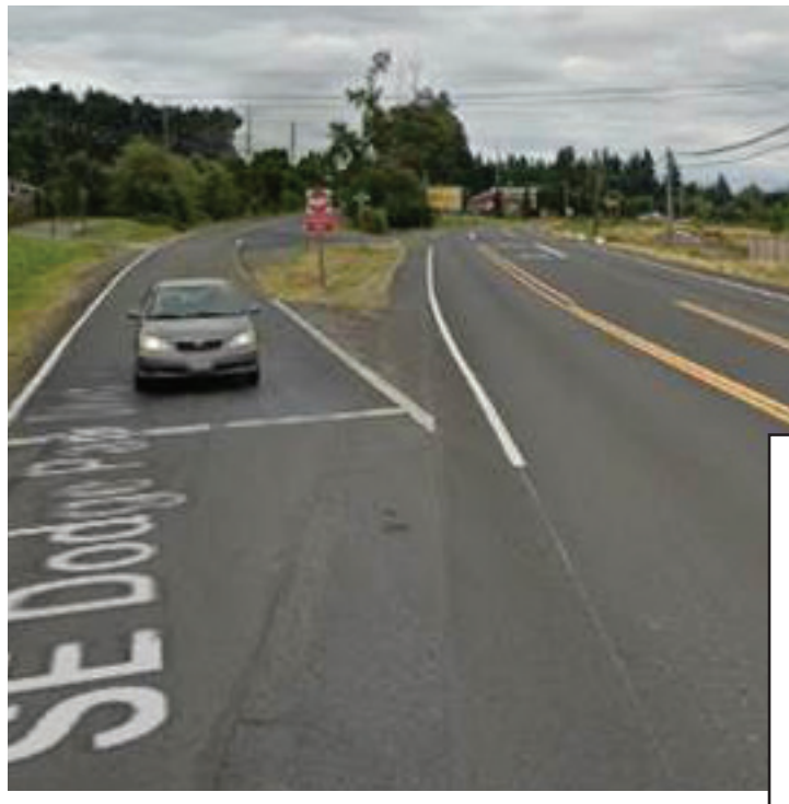
Mt. Hood Scenic Byway (Orient Drive and Dodge Park Blvd.)