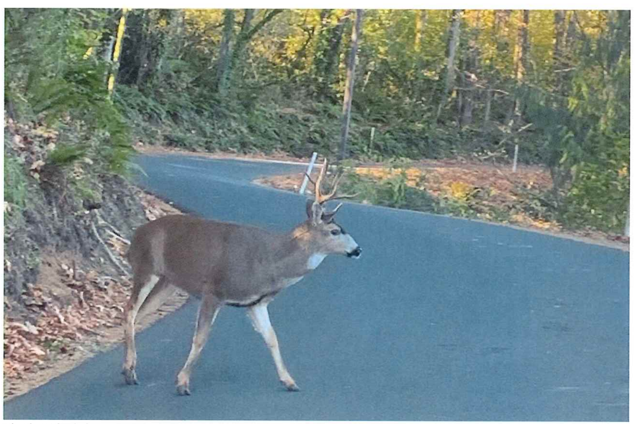
Black tailed deer