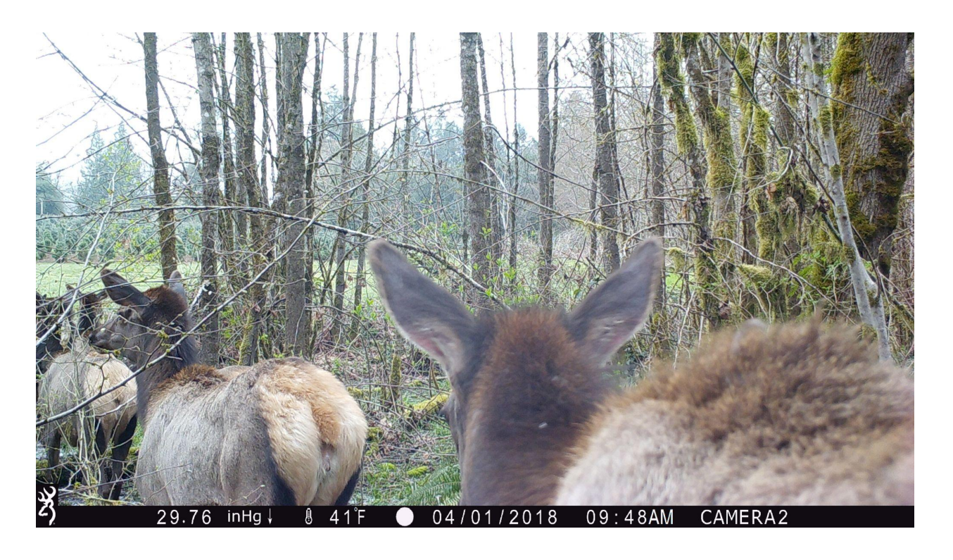
Here they are exiting the forest