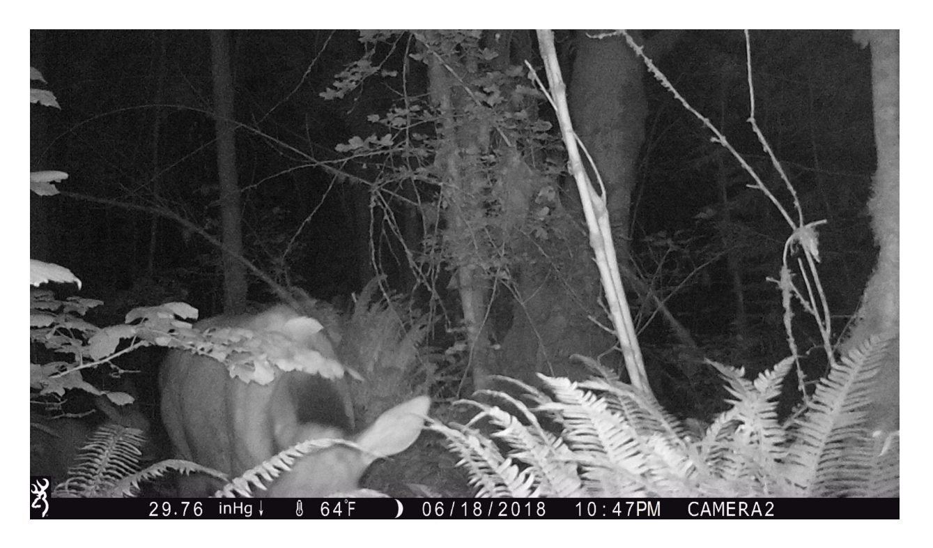
This picture is to illustrate that they live here all year. Notice date of 6/18