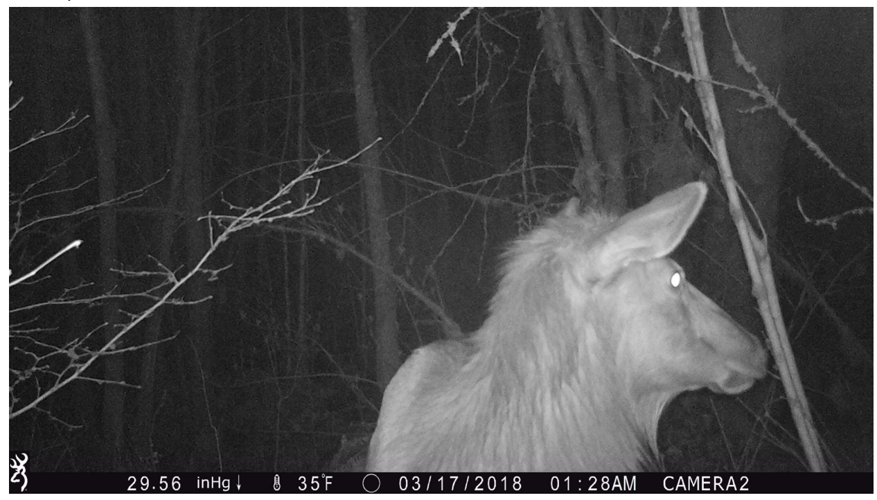
I have footage of elk in all stages of life