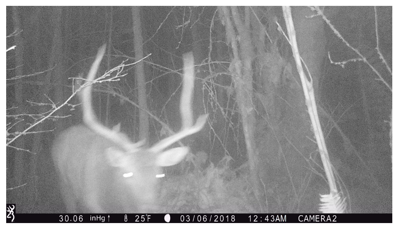
The bull elk spends the winter in these woods. The picture is from March. The cool one at the