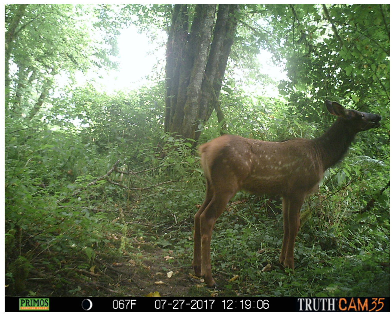
Look at the baby!