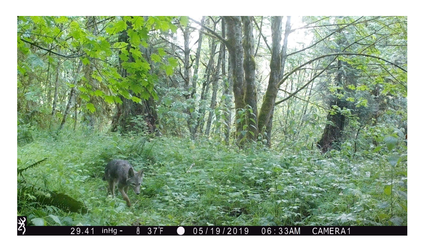
Clearly a Coyote and clearly different than the coy/wolf