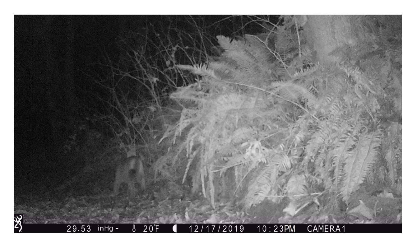
Mountain Lion tail