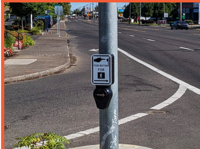
Pedestrian Push Button