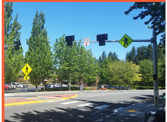
Enhanced Pedestrian Crossing