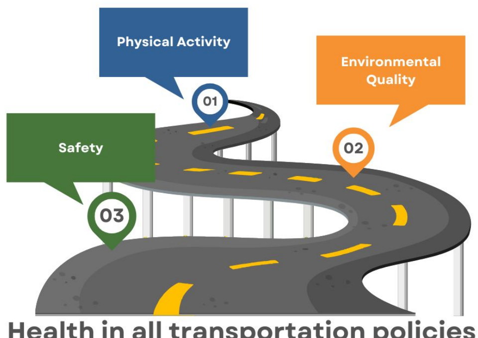
Health in all transportation policies