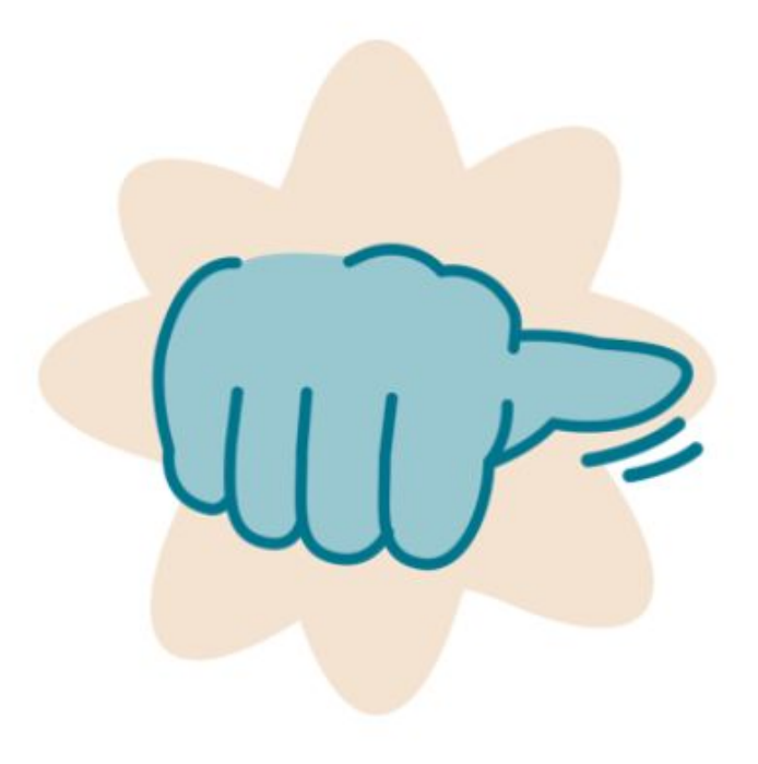
I can live with it