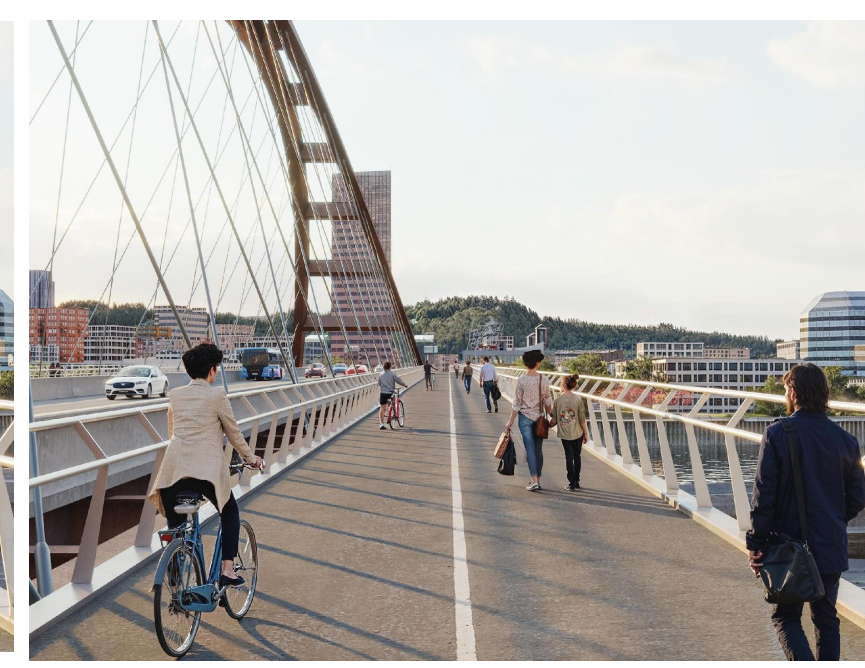
CS2- V tower