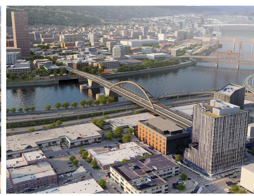
CS2- V tower