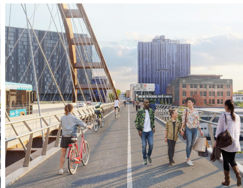
CS2- V tower