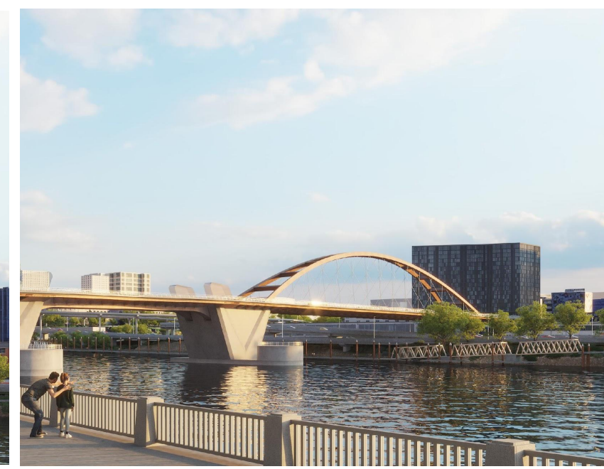
CS2- V tower