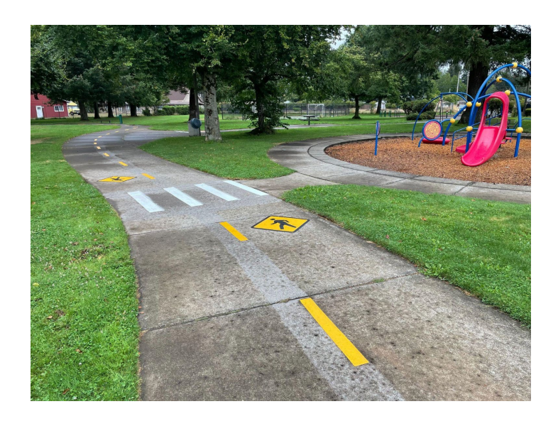
bike works by p:ear Received an award from the Street Trust at the Alice Awards for their work in East Multnomah County!