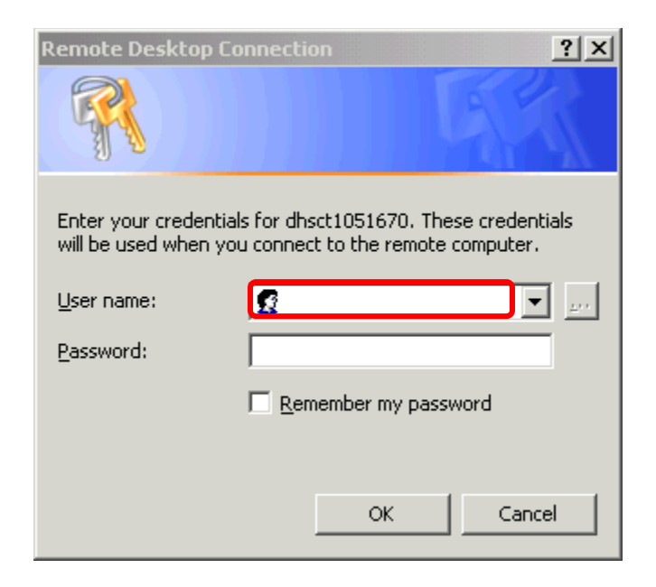
DO NOT CHECK REMEMBER MY PASSWORD

In the Password field type your password to login to your computer