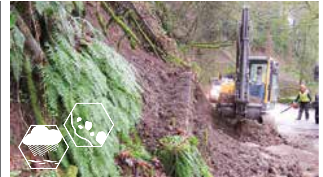
Potential impacts from warmer, wetter winters