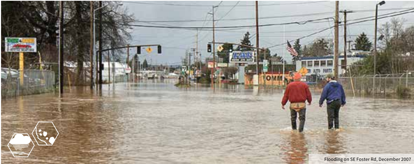
Flooding on SE Foster Rd, December 2007