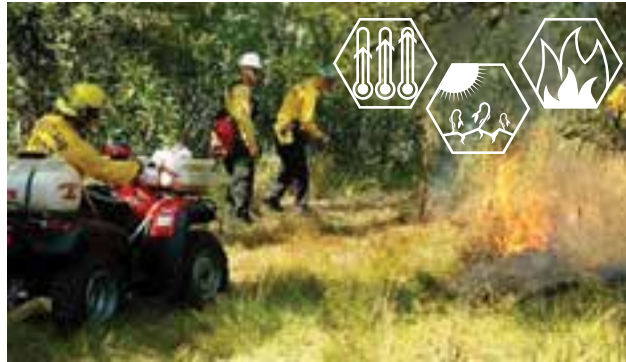
Potential impacts from hotter, drier summers with more high-heat days