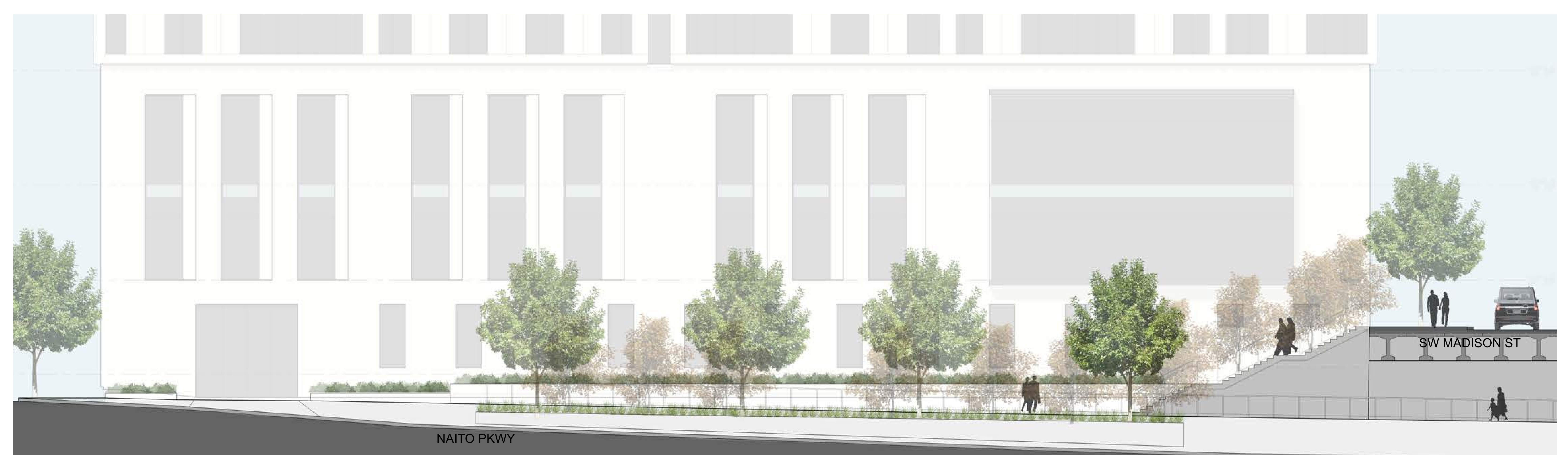
ELEVATION FROM NAITO

NOTE: ALL DESIGN INFORMATION IS IN DRAFT FORM AND SUBJECT TO CHANGE