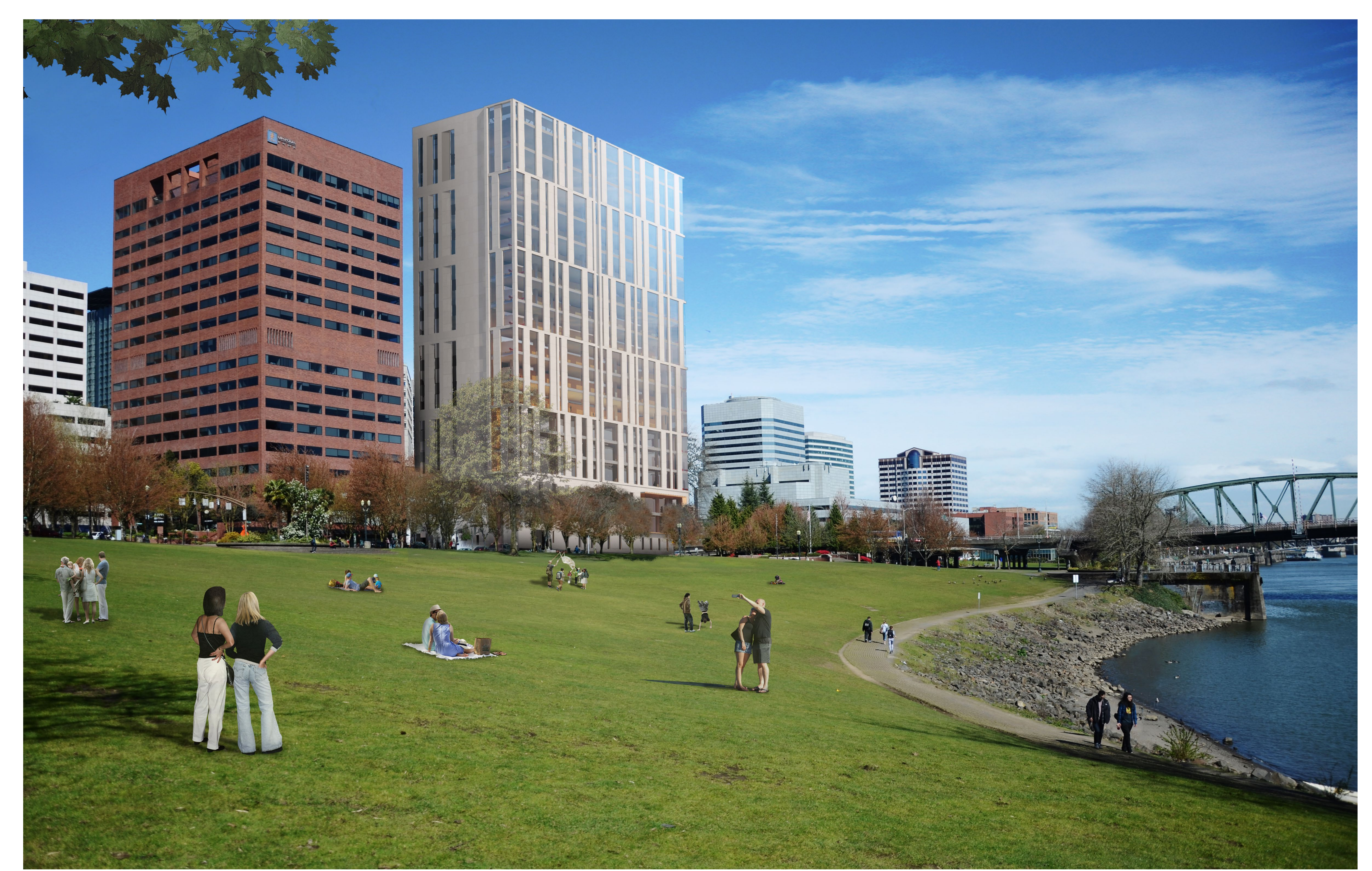
VIEW FROM WATERFRONT PARK