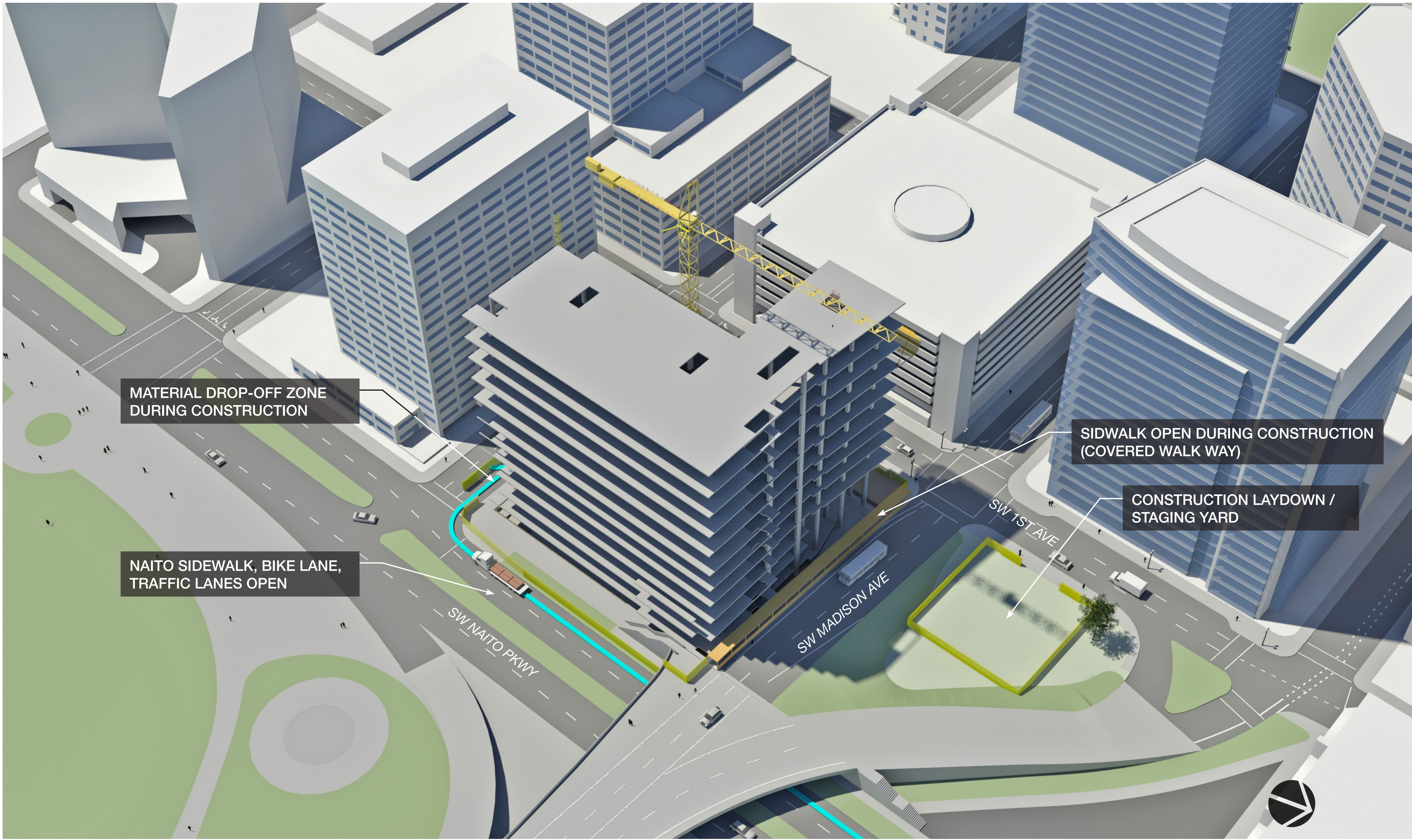
VIEW LOOKING SOUTHWEST

NOTE: ALL DESIGN INFORMATION IS IN DRAFT FORM AND SUBJECT TO CHANGE