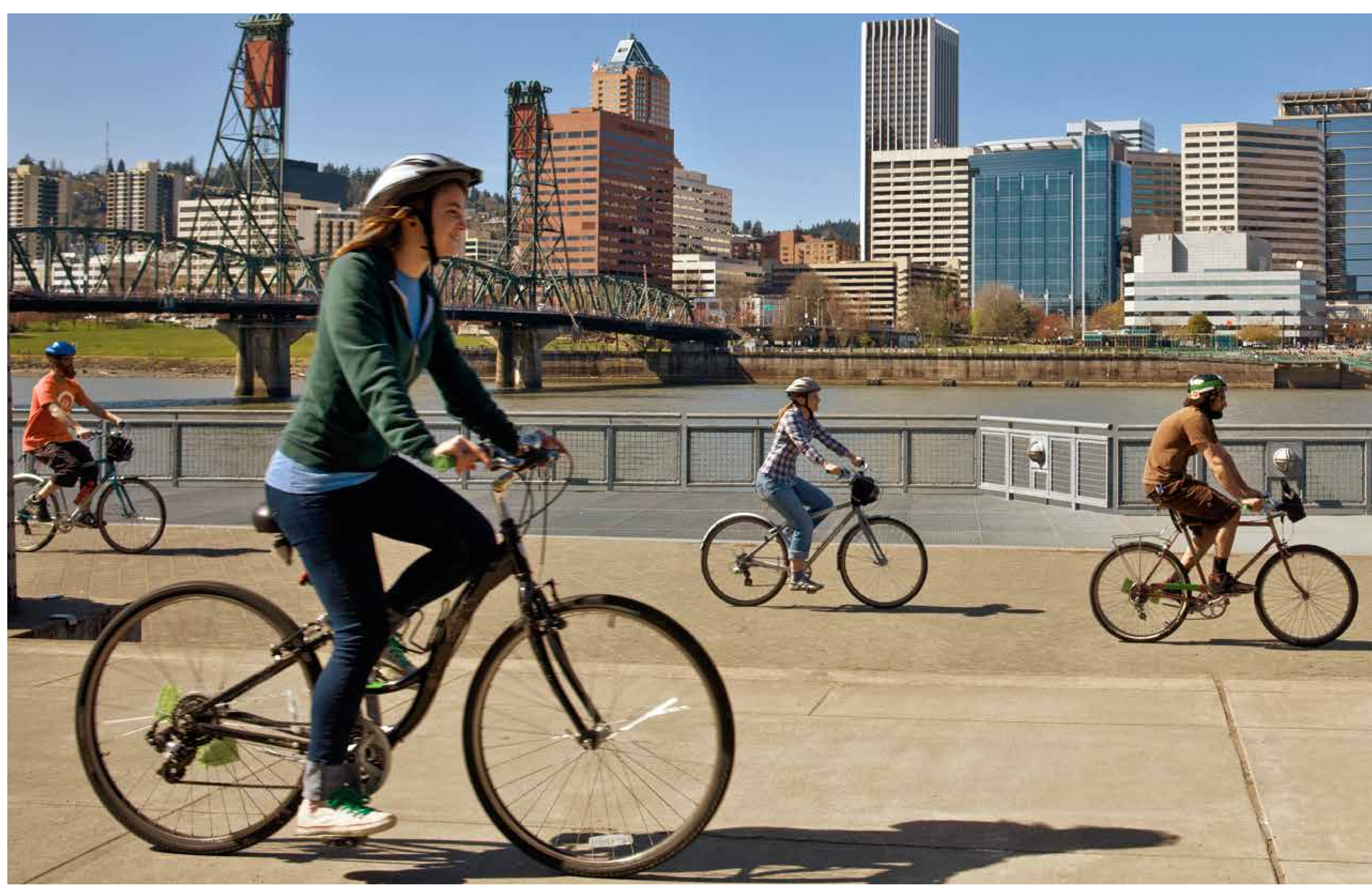
ENGAGING THE LOCAL BICYCLE AND PEDESTRIAN COMMUNITY