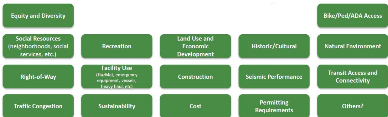
Potential evaluation criteria

Heather presented the upcoming Alternatives Evaluation phase of the project. A set of guiding principles and evaluation criteria will be developed along with further engineering, cost estimates, and technical guidance in preparation of narrowing down the remaining river crossing options to a range a feasible alternatives that will go proceed to the National Environmental Policy Act (NEPA) phase of the project. Example of potential criteria topics include: