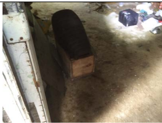
Unsanitary floor covering