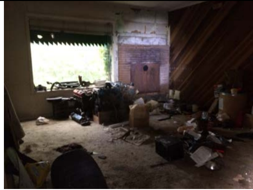
T&D on interior