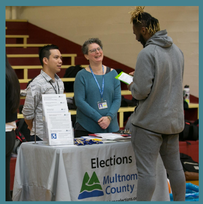
Elections staff attend a high school civics event in 2017.