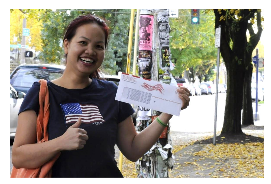
New Citizen and First Time Voter, November 2014 Election, Multnomah County Elections