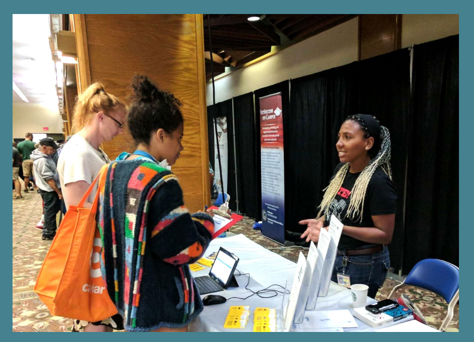
Elections staff reaches out to veterans at Portland's Veterans Stand Down event in 2017.

★ Share what civic engagement and participation mean to you? What are ways you are involved in the community?