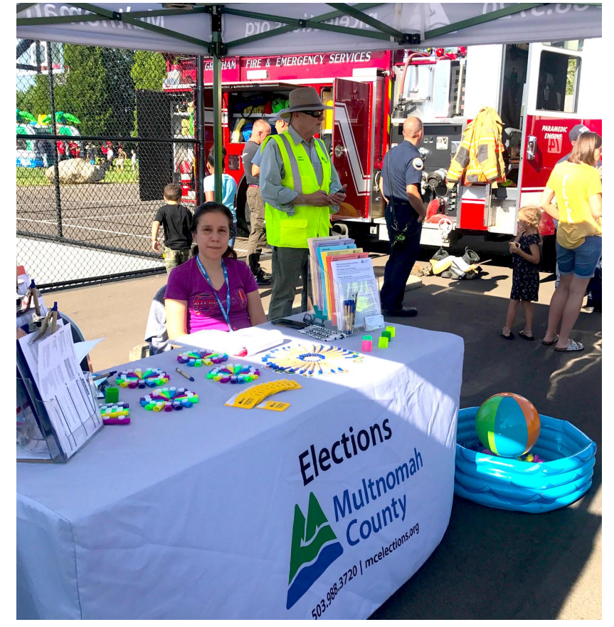
Registering voters to vote at Wood Village Night Out in summer 2019.

We do not discuss or endorse any candidates or measures.