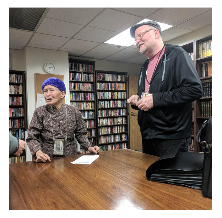
Elections staff work with an interpretation service to provide assistance in the voter's preferred language, 2018.