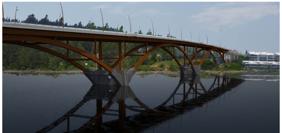
Conceptual rendering of the Sellwood Bridge looking east.