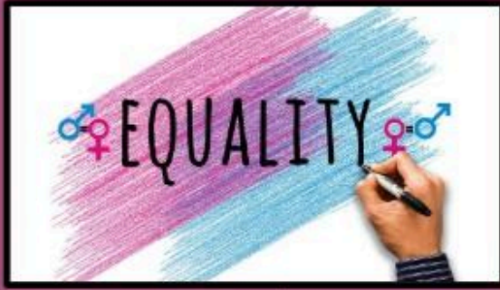
Gender Equality Month

Join Proclamation Ceremony 1/14/26 at Noon: https://www.youtube.com/MultCoBoard