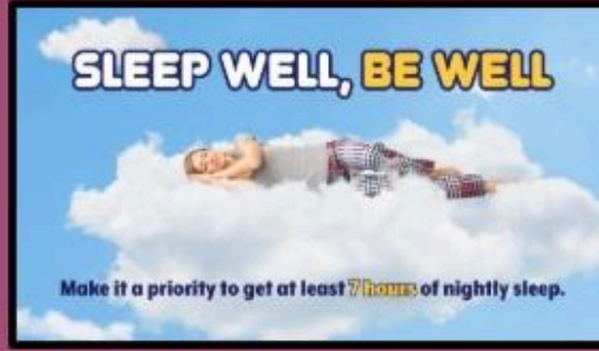
World Sleep Day (March 13)