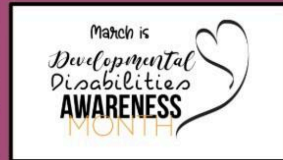
Developmental Disabilities Awareness Month