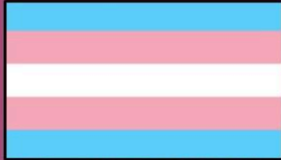
Transgender Day of Visibility (March 31)