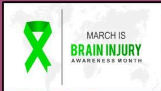
Brain Injury Awareness Month