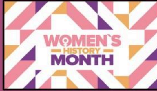
Women's History Month & Women in Sustainability