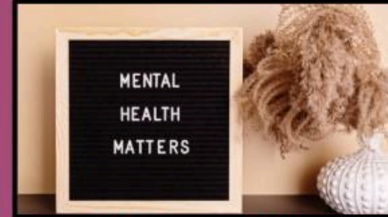
Self Injury and Harm Awareness Day (March 1)