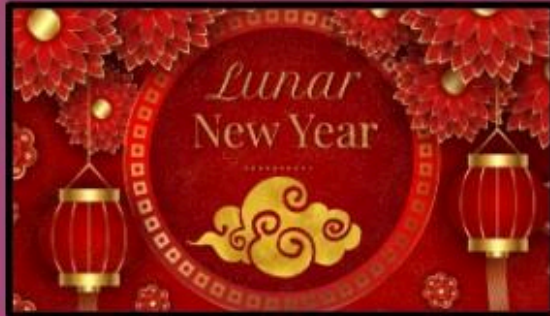
Lunar New Year

Join Proclamation Ceremony 3/4/26 at Noon: https://www.youtube.com/MultCoBoard