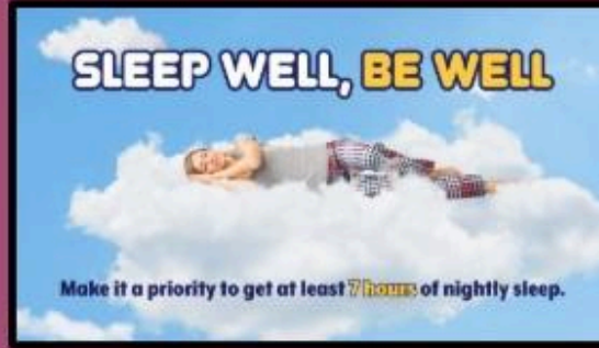
World Sleep Day (March 13)