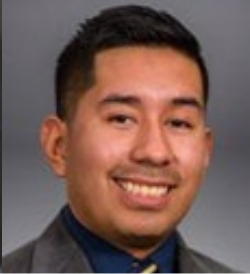
HD50