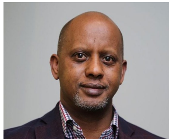
Senate Majority Leader Kayse Jama (D-E Portland)