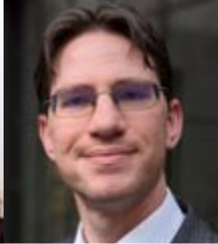
HD49 | Hudson