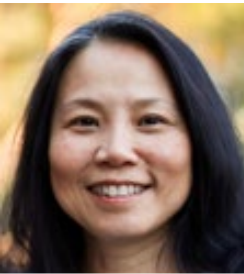
HD45 | Tran