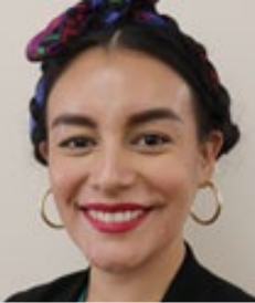
HD47 | Valderrama