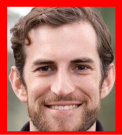
HD46 | Chotzen