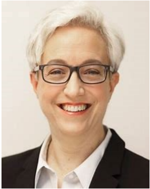
Tina Kotek (D)