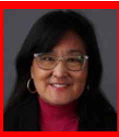
HD34 | Wantabe