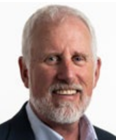
HD41 | Gamba