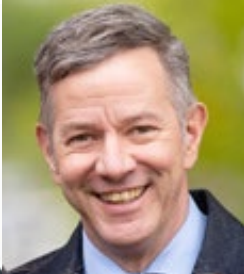
HD42 | Nosse