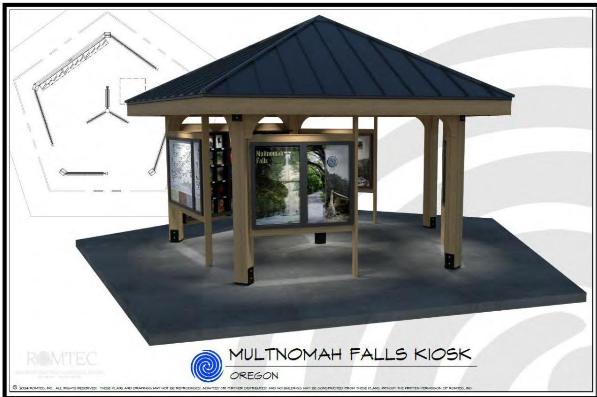
Figure 3. Detail render of proposed new information kiosk. Image from permit application.