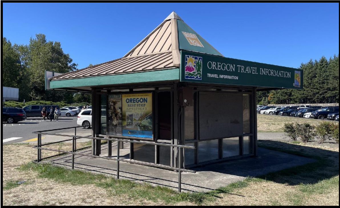
Figure 4: Rear (east) elevation of the information Kiosk. View 266°. Photo taken on 09/22/2025.

Do not use this form for ODOT, Federal Highway projects or to record archaeological sites