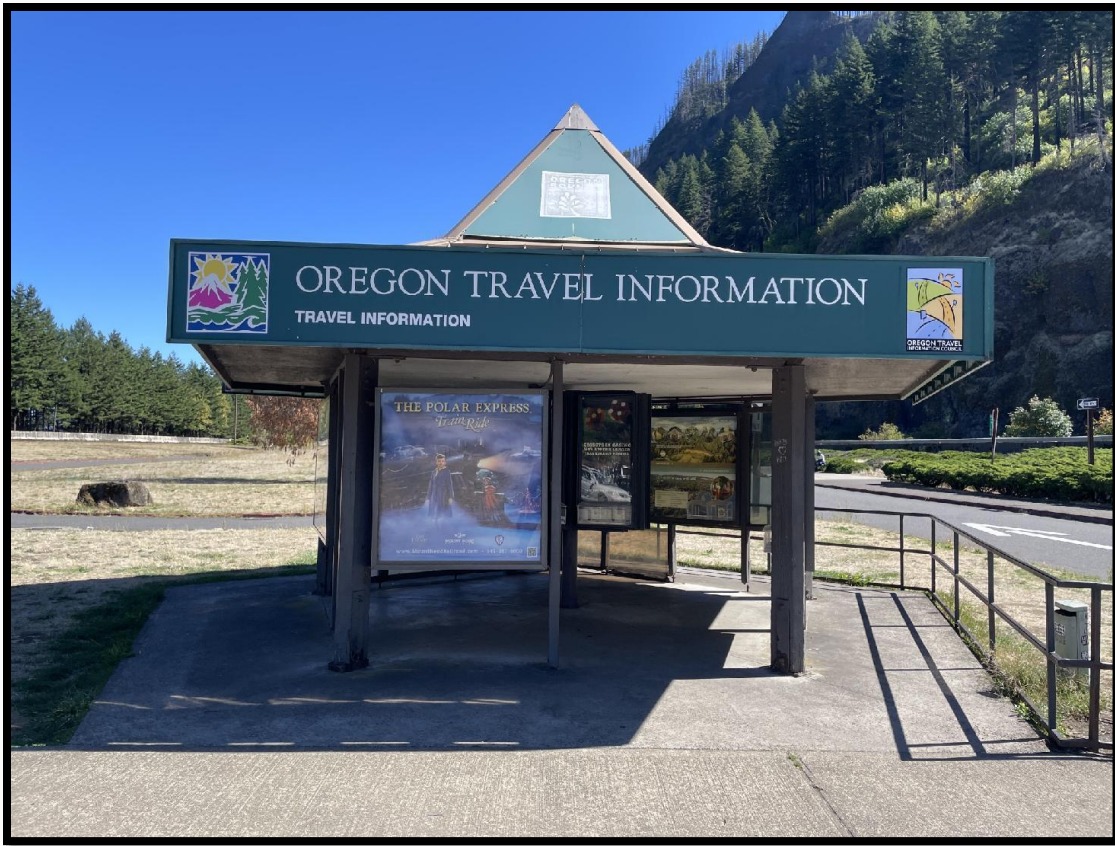
Figure 6: Front (west) elevation of the information Kiosk. View 116°. Photo taken on 09/22/2025.

Do not use this form for ODOT, Federal Highway projects or to record archaeological sites