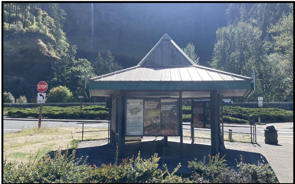
Figure 7: North elevation of the information kiosk. View 191°. Photo taken on 09/22/2025.