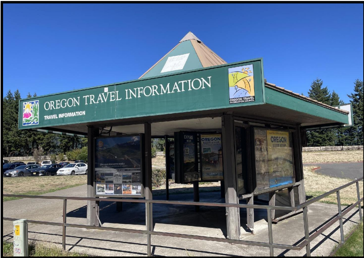
Figure 5: South elevation of information Kiosk. View 48°. Photo taken on 09/22/2025.