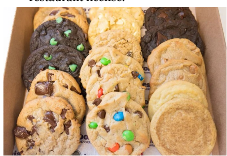
Baked goods (like cookies, donuts and fruit pies), candied apples and kombucha must now meet these requirements

An establishment that vends raw juices other than raw citrus juices at an event must obtain a temporary restaurant license.