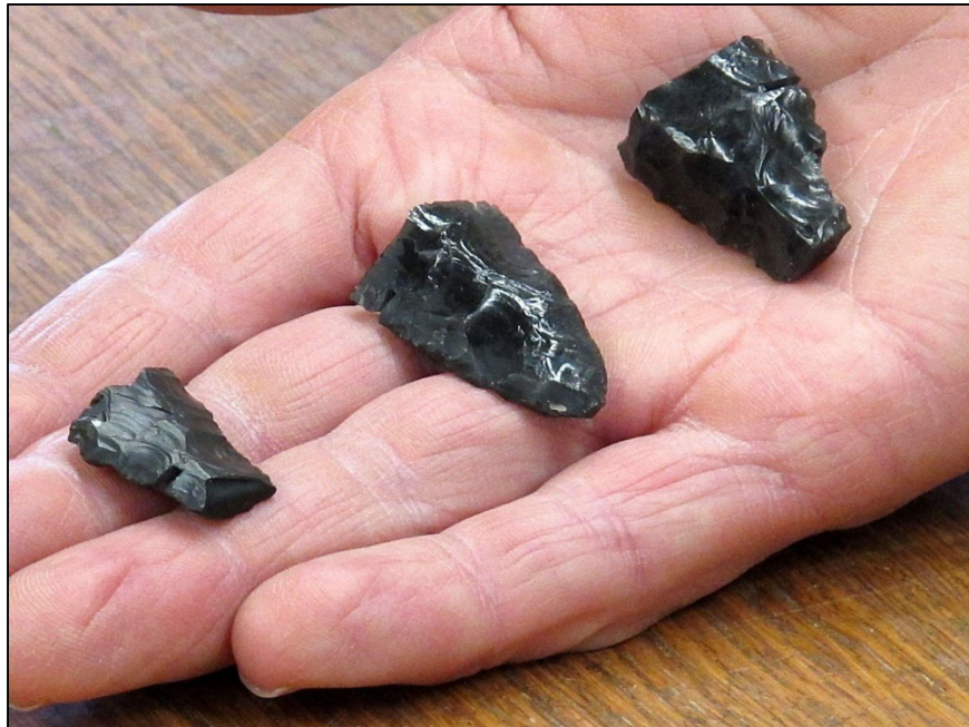
Obsidian stone tool fragments