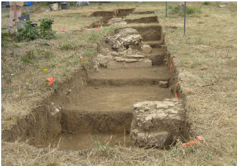
Historic building foundations (Oregon SHPO)