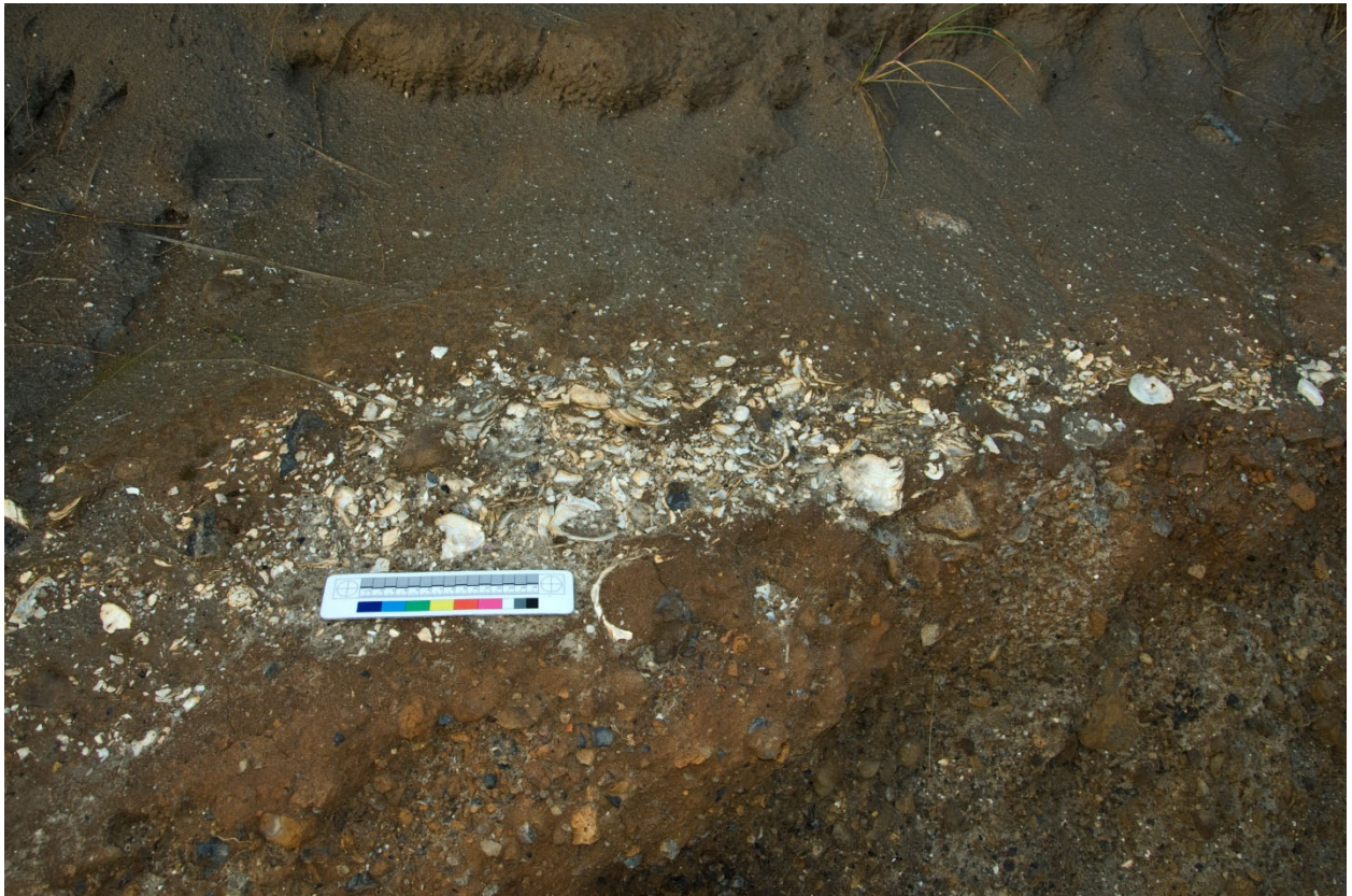
Shell midden (Oregon SHPO)