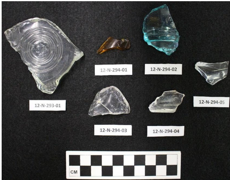
Historic glass artifacts