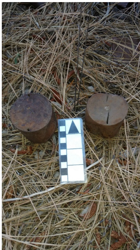
Historic metal artifacts; hole-in-cap cans