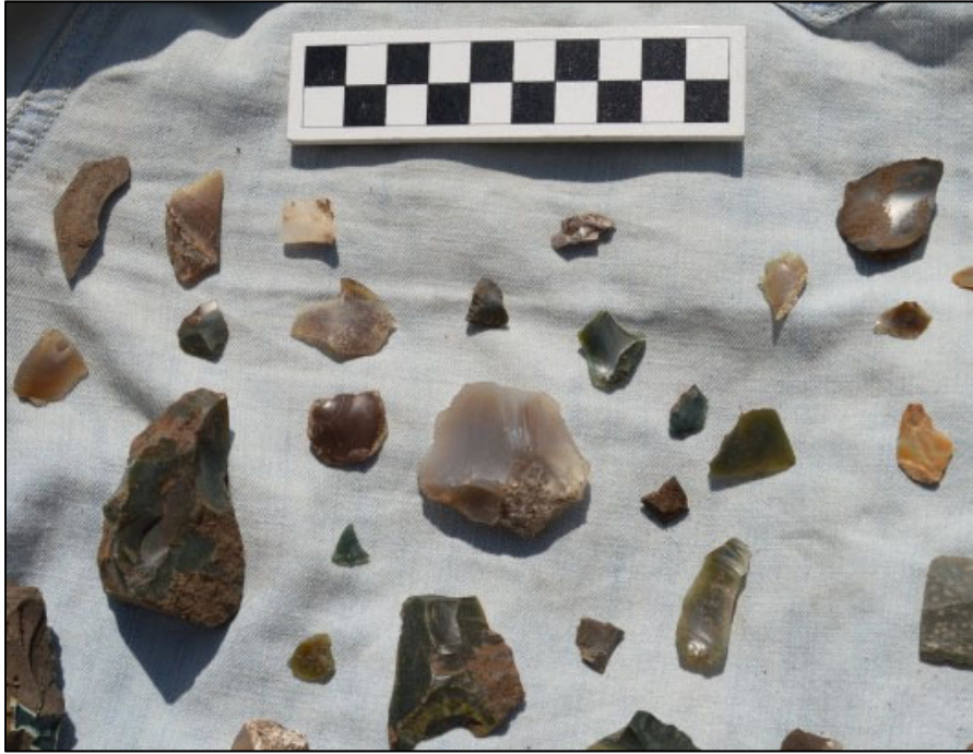
Stone flakes (Oregon SHPO)