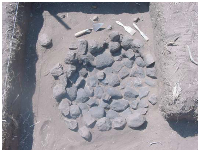
Example of camas oven feature