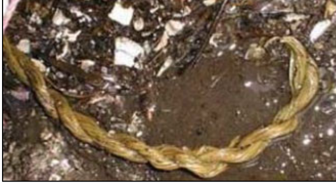
Preserved cordage