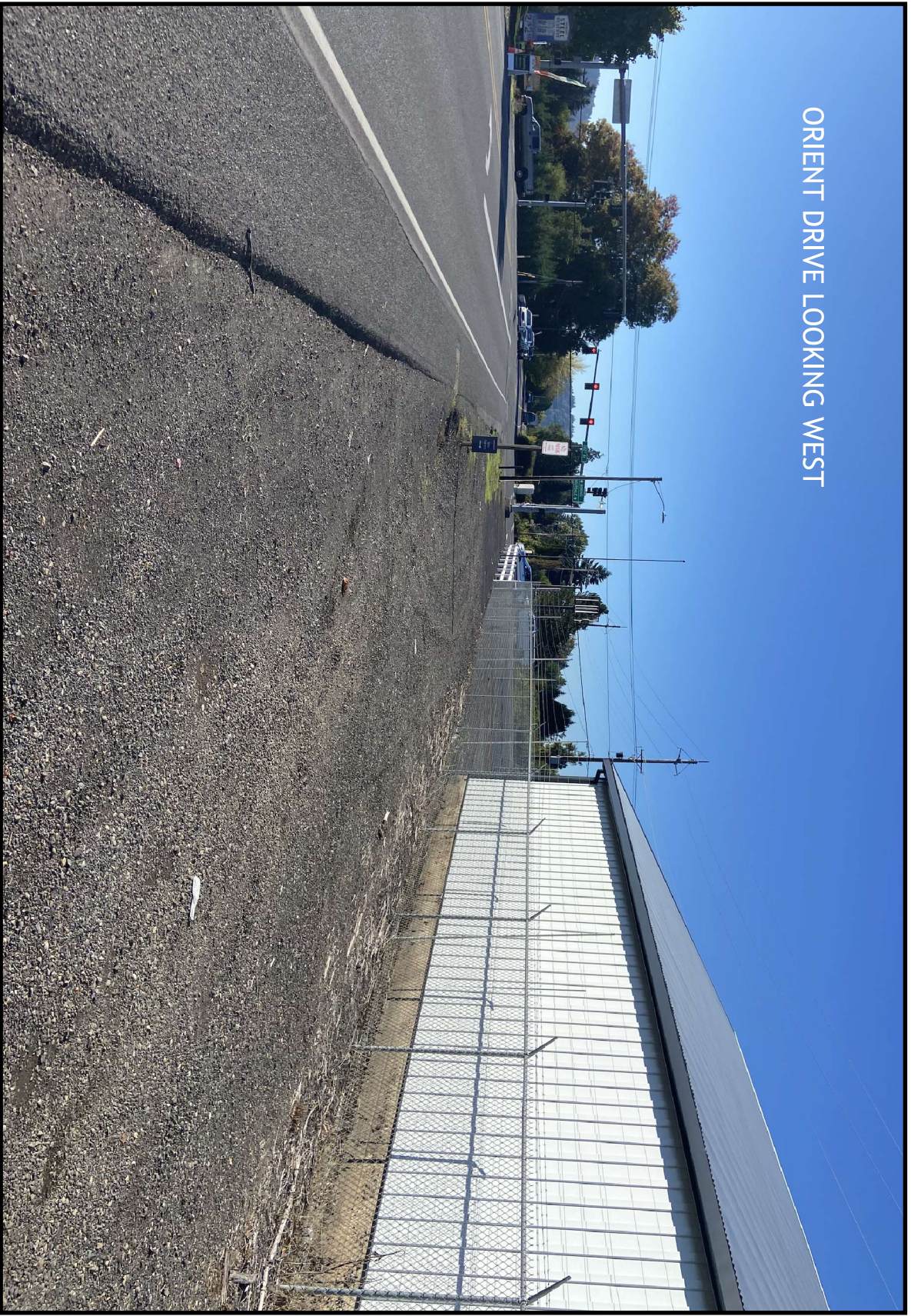
ORIENT DRIVE LOOKING WEST