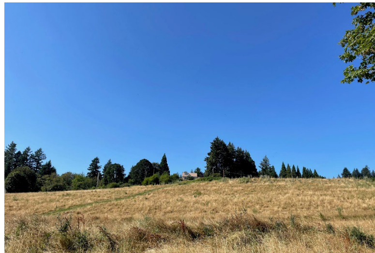
Figure 4. Meadow area, looking toward NW Springville Road and proposed home site.

Most of the study area is an open meadow not currently used for farming or other activities. this area is vegetated with introduced grasses typically used as pasture forage. Species include tall fescue ( Festuca arundinacea ), velvetgrass ( Holcus lanatus ), orchardgrass ( Dactylus glomerata ), bluegrasses ( Poa spp. ), and creeping bentgrass ( Agrostis stolonifera ). Himalayan blackberry, English hawthorn, docks ( Rumex acetocella ; Rumex acetocella ), thistles ( Cirsium arvense ; C. vulgare ), teasel, and tansy ragwort ( Senecio jacobaea )