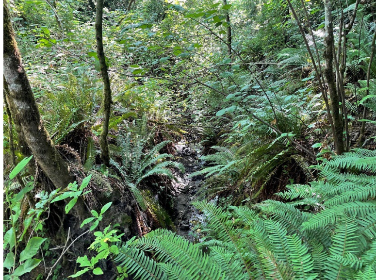
Figure 3. Stream corridor looking downstream. Channel is 6 to 10 feet below ferns.

Bannister Creek (Figure 1) flows southwesterly across the property, joining Bronson Creek offsite to the southwest. Bronson Creek flows into Beaverton Creek, ultimately flowing into the Tualatin River. The tributary stream corridor is steeply incised down to the stream channel. The channel lacks adjacent wetlands, but flow in late July indicates groundwater support of stream hydrology.