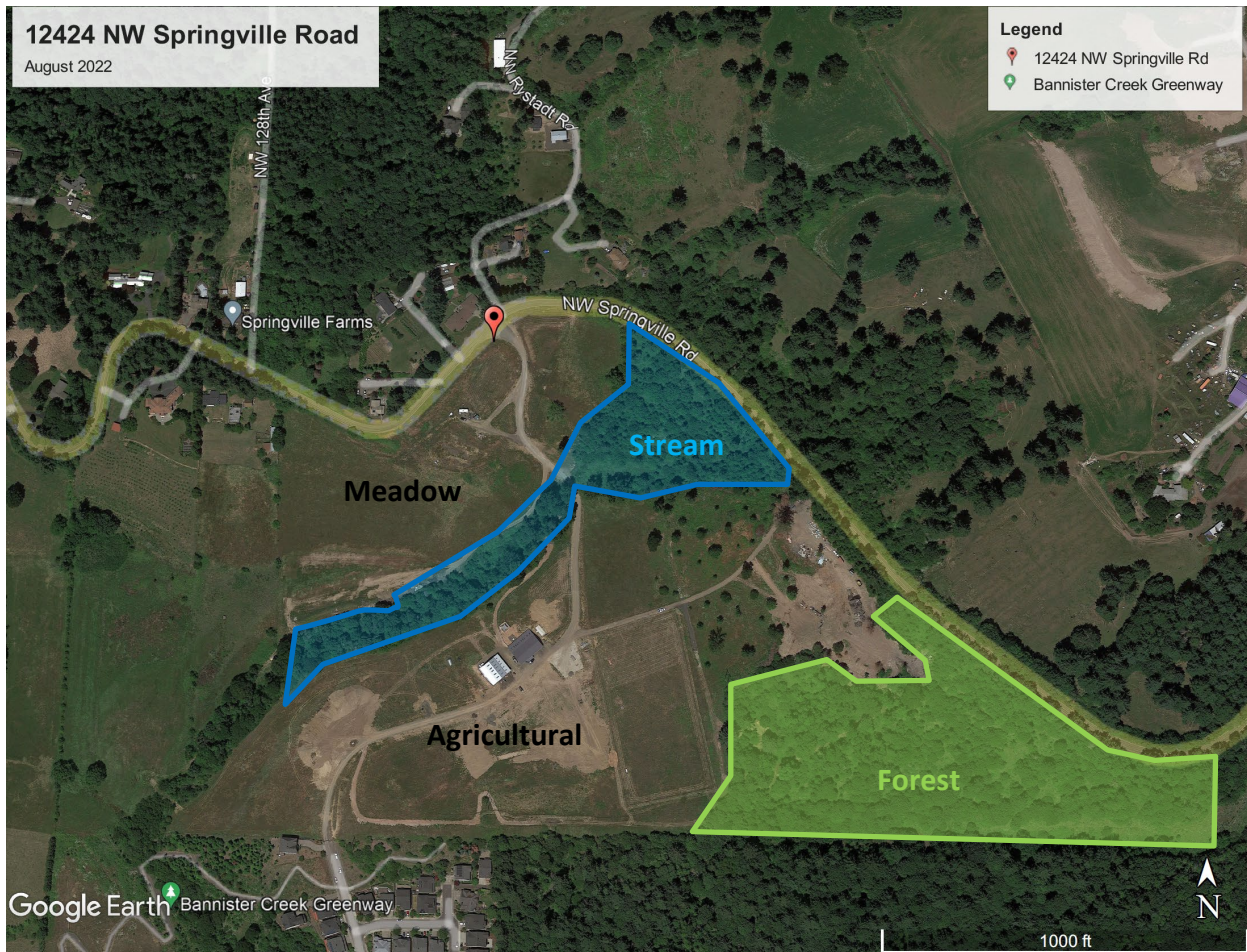
Figure 2. Site overview with habitat types

The subject property contains four primary habitat areas, as shown on Figure 2 below: the Bannister Creek corridor, the meadow area on either side of the stream corridor, the area used for chicken egg production, and an upland forest in the southeastern portion of the site. The proposed farm dwelling is on the north side of the site, within the “meadow area”.