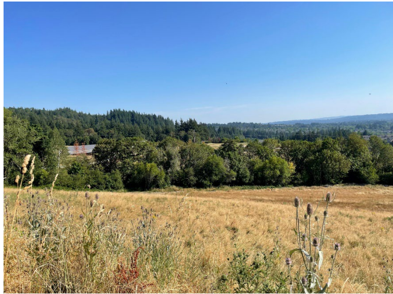
Figure 5. Riparian corridor. Proposed mitigation would expand it toward the viewer.

invasive cover in the open meadow area is light, but heavier in the interface area between open meadow and the riparian zone of Bannister Creek and its tributary. Colonies can be expected to expand in size and density if not actively managed.