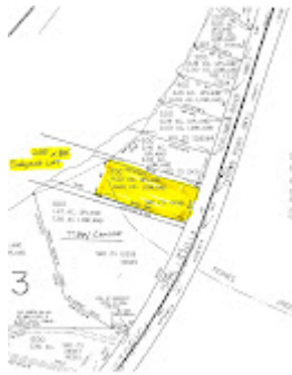
Sandy River Plat Map Color.jpg 432K

The 10 foot setback from the East Columbia River Hwy. would condemn this lot.