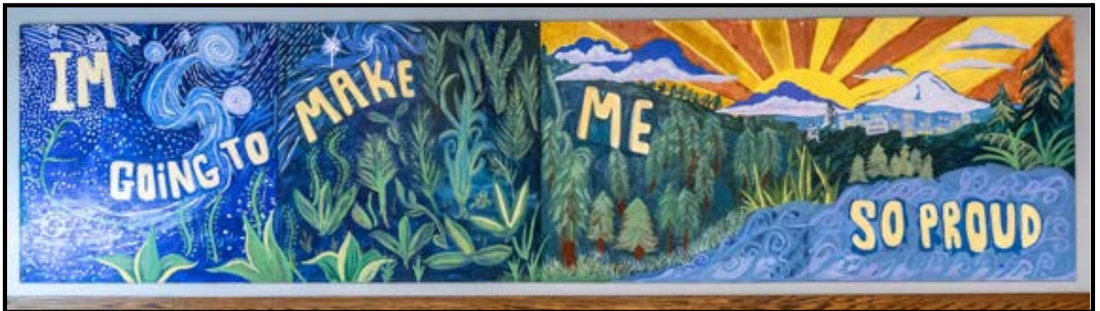
A mural on display at a Multnomah County Department of Community Justice facility.