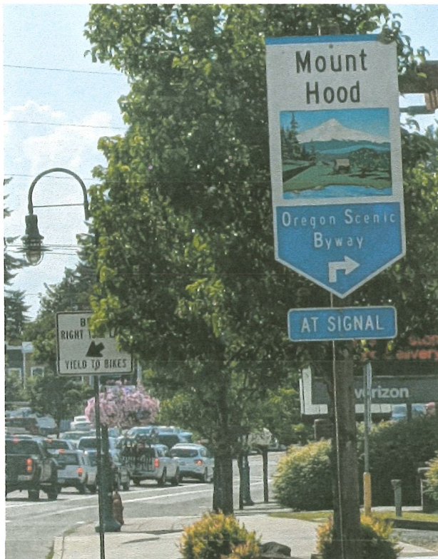
Mt. Hood Scenic Byway in Sandy, OR. Signage directs visitors from Hwy. 26 to Bluff Road.

The Mount Hood Scenic Byway is a part of the National Byways Scenic program — a grass-roots collaboration effort established to recognize, preserve and enhance selected roads throughout the United States based on archaeological, cultural, historic, natural, recreational or scenic qualities. These roads are collectively known as America's Byways.