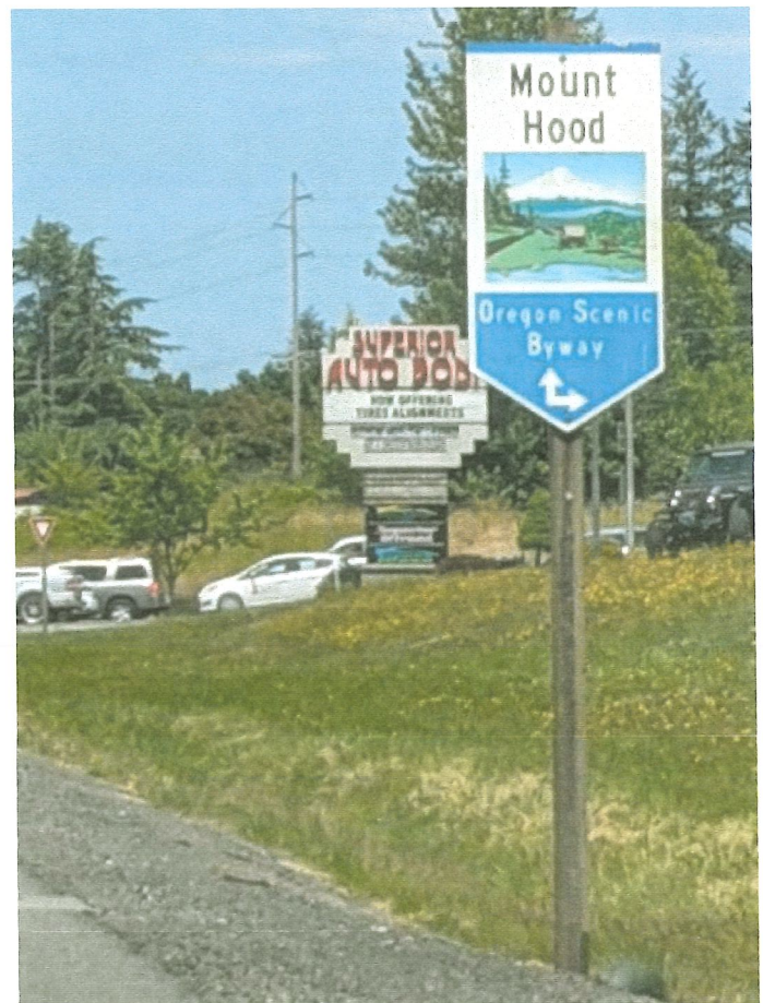
Heading into Gresham from Hwy. 26. Directs traffic right to Orient Dr., then left onto Dodge Park Blvd.