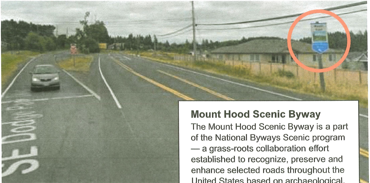
Mt. Hood Scenic Byway (Orient Drive and Dodge Park Blvd.)