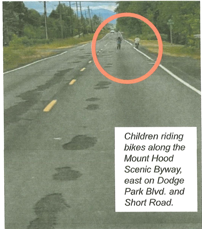
Children riding bikes along the Mount Hood Scenic Byway, east on Dodge Park Blvd. and Short Road.

If approved the construction of this Water Treatment Plant facility and pipeline will do irreparable damage to a cherished community and way of life. It is not just the safety, environmental, and livability issues during the four plus years of construction disruption. Lost will be the soul and character of a cherished community and way of life that our ancestors preserved and protected for over a century.