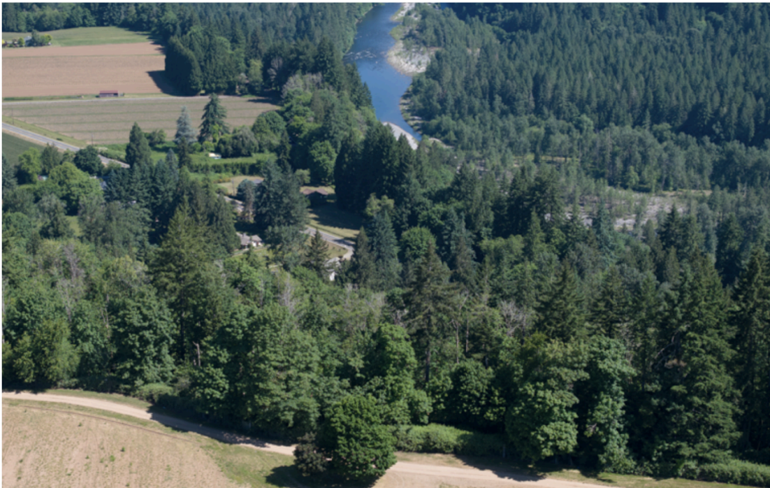
Illustrating the proximity of the site to the Sandy River Gorge, a Wild and Scenic Protected Area.

The filtration plant site is not even a quarter mile away from the Sandy River Gorge protected area.