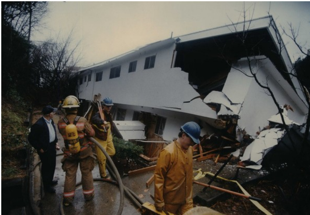
A residential building that was destroyed in a 1996 landslide in Portland, shown on February 8, 1996.