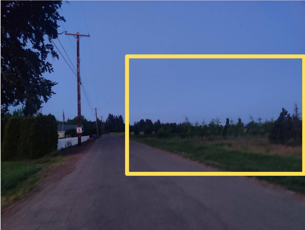
Looking at PWB site - This area will have a glow in the night sky landscape from the MANY MANY 24/7 lights at the facility.