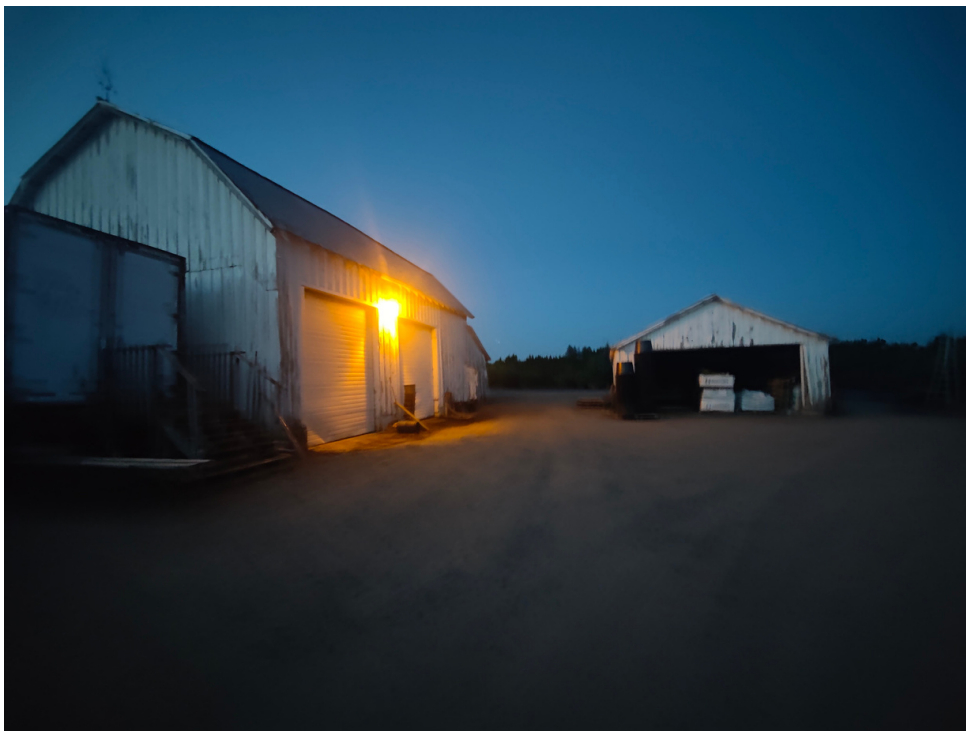
Light on R&H Barn - This light is NOT visible from anywhere except directly within a small radius. It is NOT visible from the street or from any of the residence nearby. This picture was taken on site about 50 feet away with permission of the landowner.