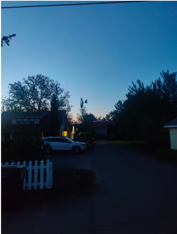
Evening Sky view from East end Carpenter Lane on evening walk, 35075 SE Carpenter Lane

The following items address MCC 39.7515 Conditional Use Approval Criteria [A] Is Consistent with the character of the Area