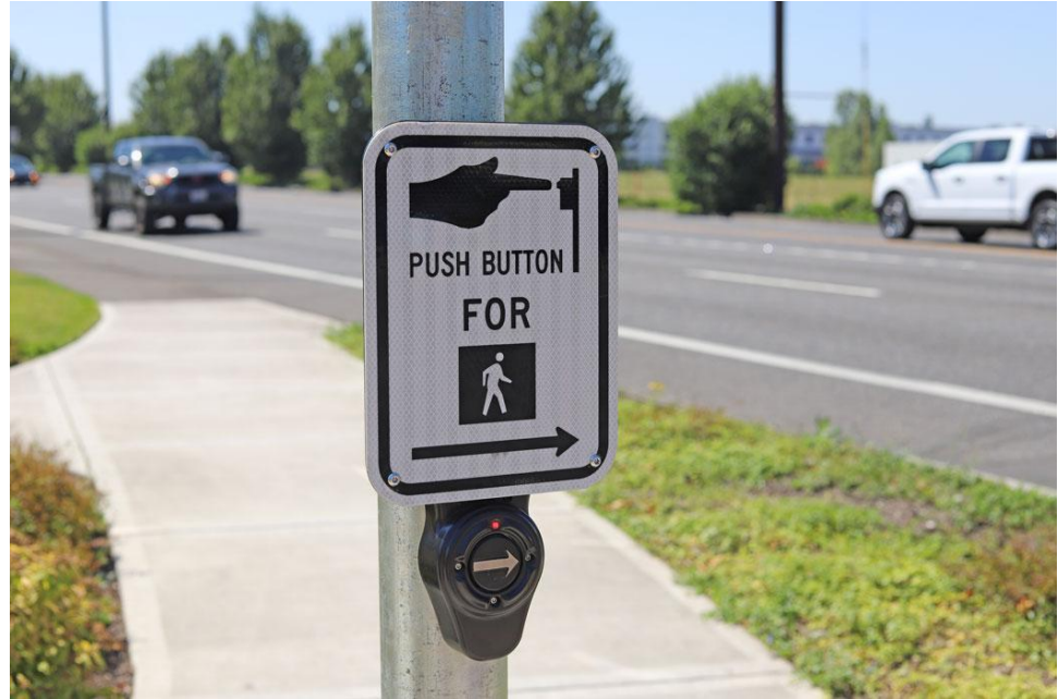
Photo of a pedestrian push button at a traffic signal