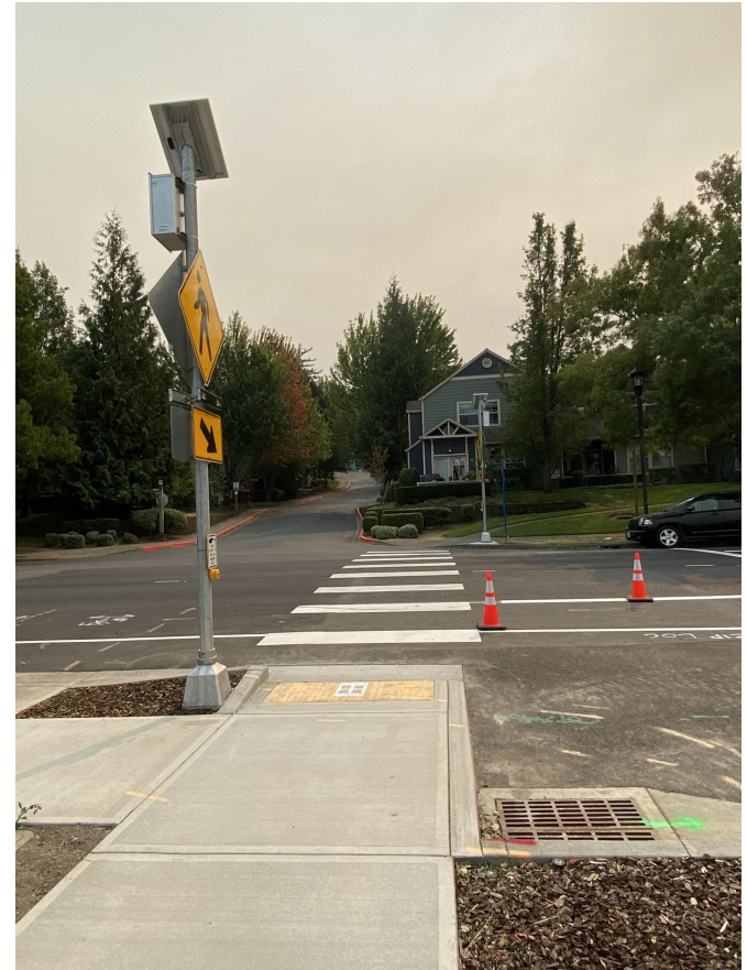
Kennedy Park Subdivision - Halsey St Mid Block Crossing