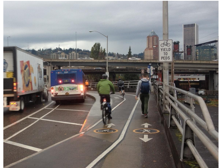
Picture of Westbound Hawthorn Bridge bus stop with bike lane and sidewalk