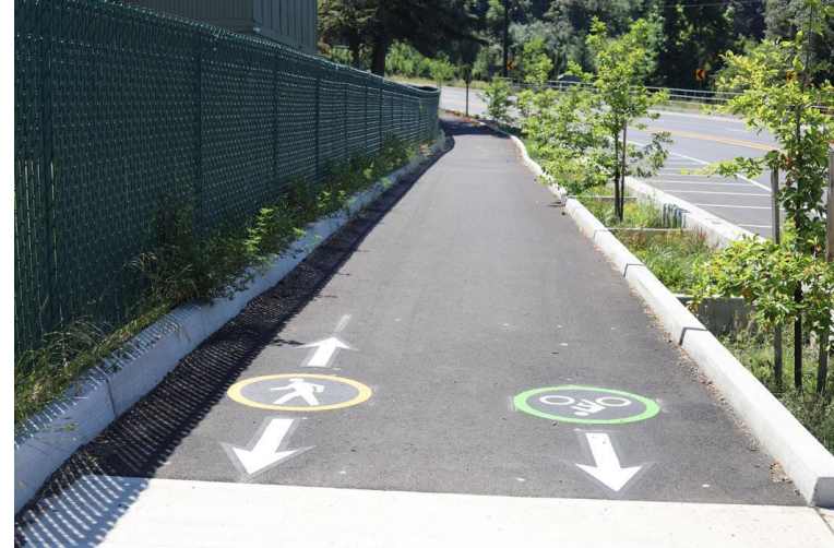
Picture of multiuse path along 238th Drive