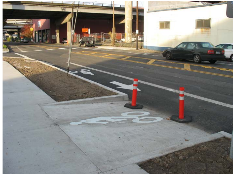
Water Ave bike ramp from Morrison Bridge