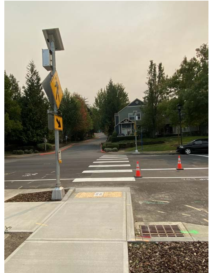
Kennedy Park Subdivision - Halsey St Mid Block Crossing