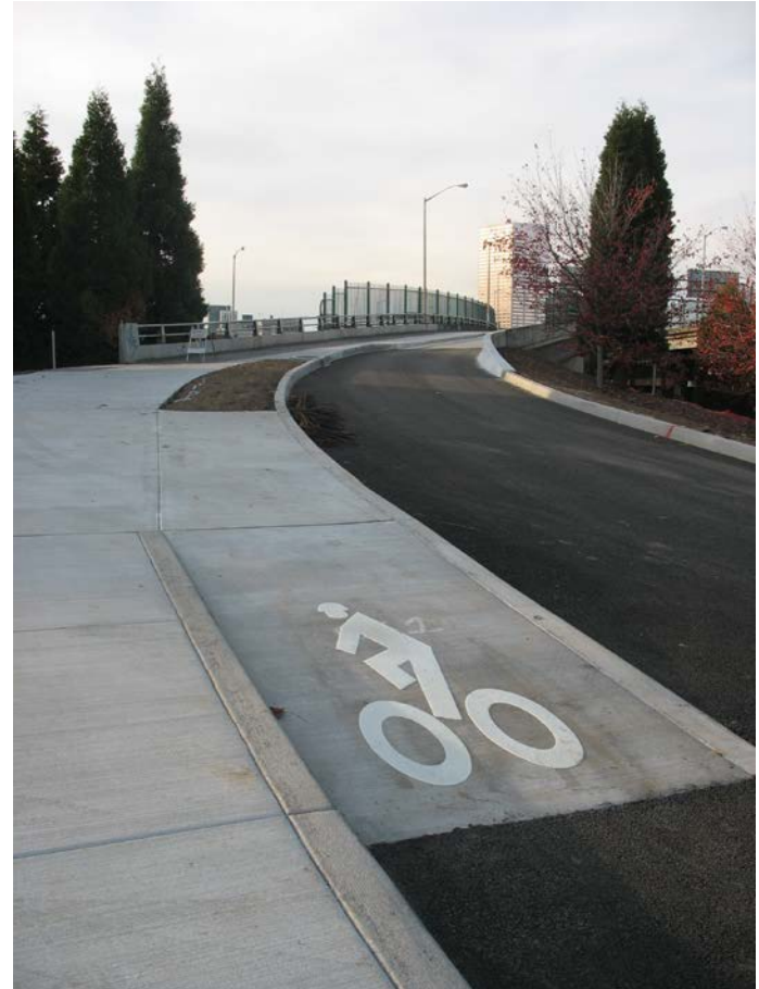
Bike ramp from Morrison Bridge to Water Ave ramp