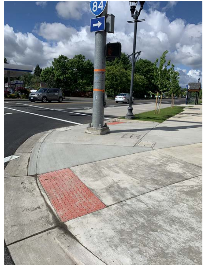
Wood Village Mixed Development NW corner 238th And Halsey