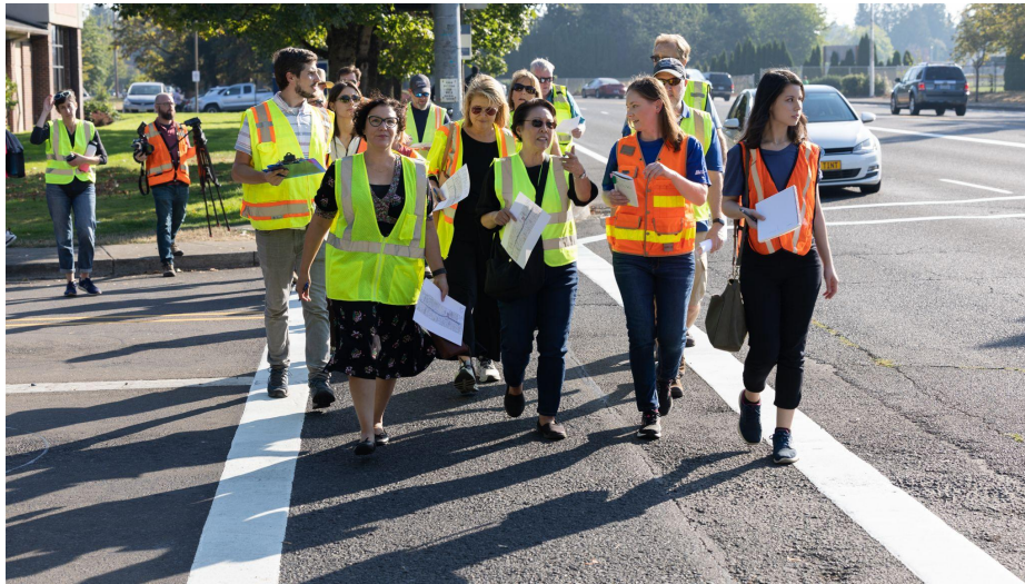
2022: Walking tour along NE 257th Dr.