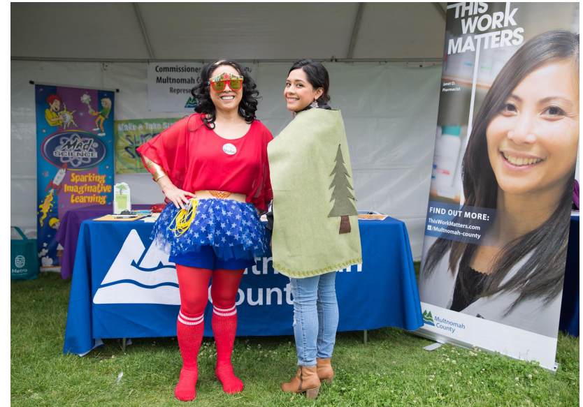
2017: Gresham Rock the Block event