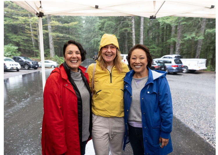
E Larch Mountain Road Reopening, 2023