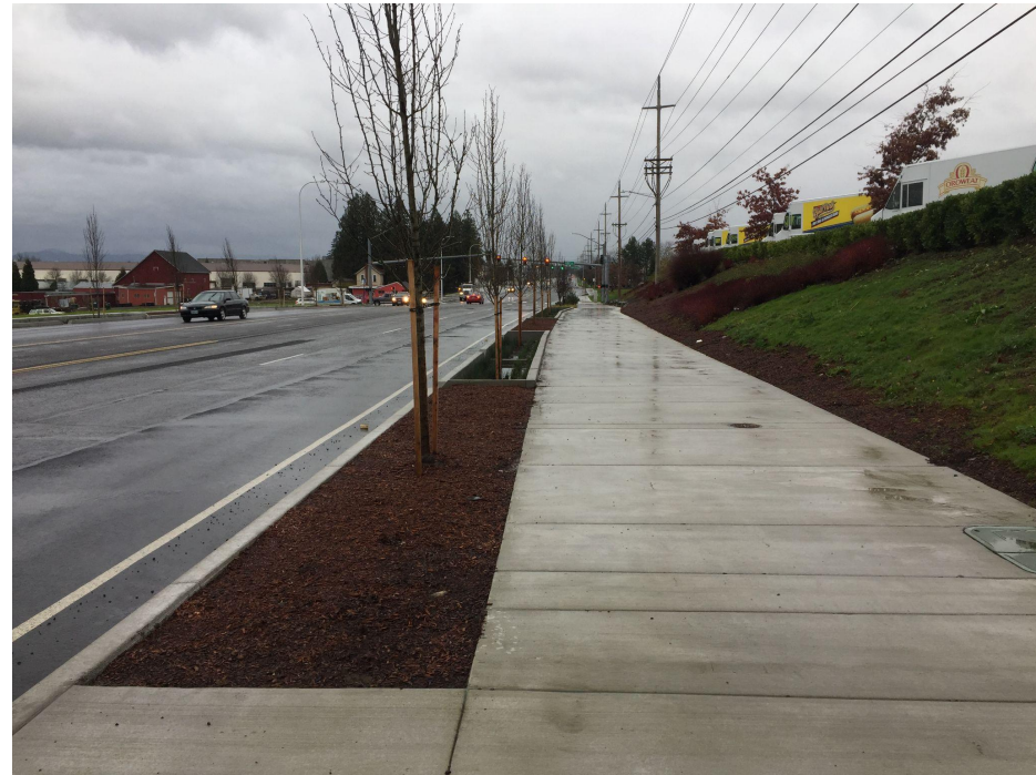
Gresham RFFA project - Construction on Sandy Blvd