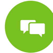
2 Focus Groups