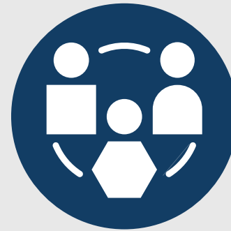
Policy 4: Community- Centered & Inclusive Programs