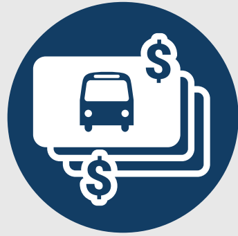
Policy 2: Financial Incentive Programs