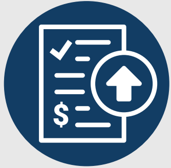
Policy 1: TDM Policy, Planning & Funding