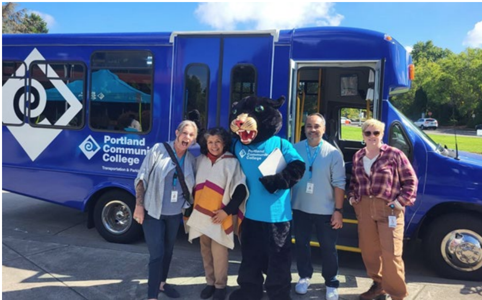
Shuttle promotion at Portland Community College