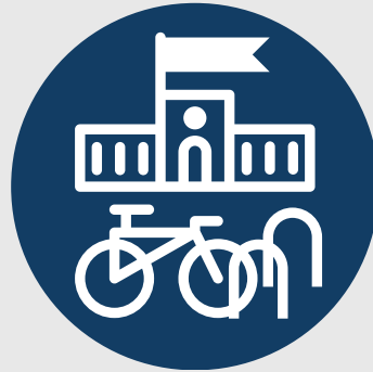
Policy 3: Place and Event-based Programs