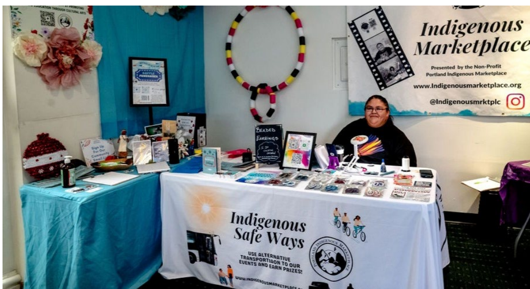
Indigenous Safe Ways Program at Portland Indigenous Marketplace, promoting the use of active transportation through community-led marketing campaign