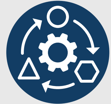
Policy 5: Adaptive & Resilient Programs