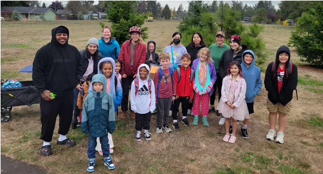
Walking School Bus at Menlo Park Elementary in David Douglas School District

PBOT's Transportation Wallet provides incentives for transit and shared micromobility in parking districts, multifamily housing & for people living on low incomes