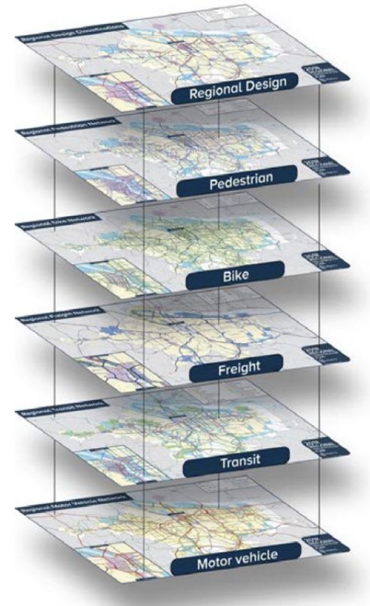
RTP Transportation Networks