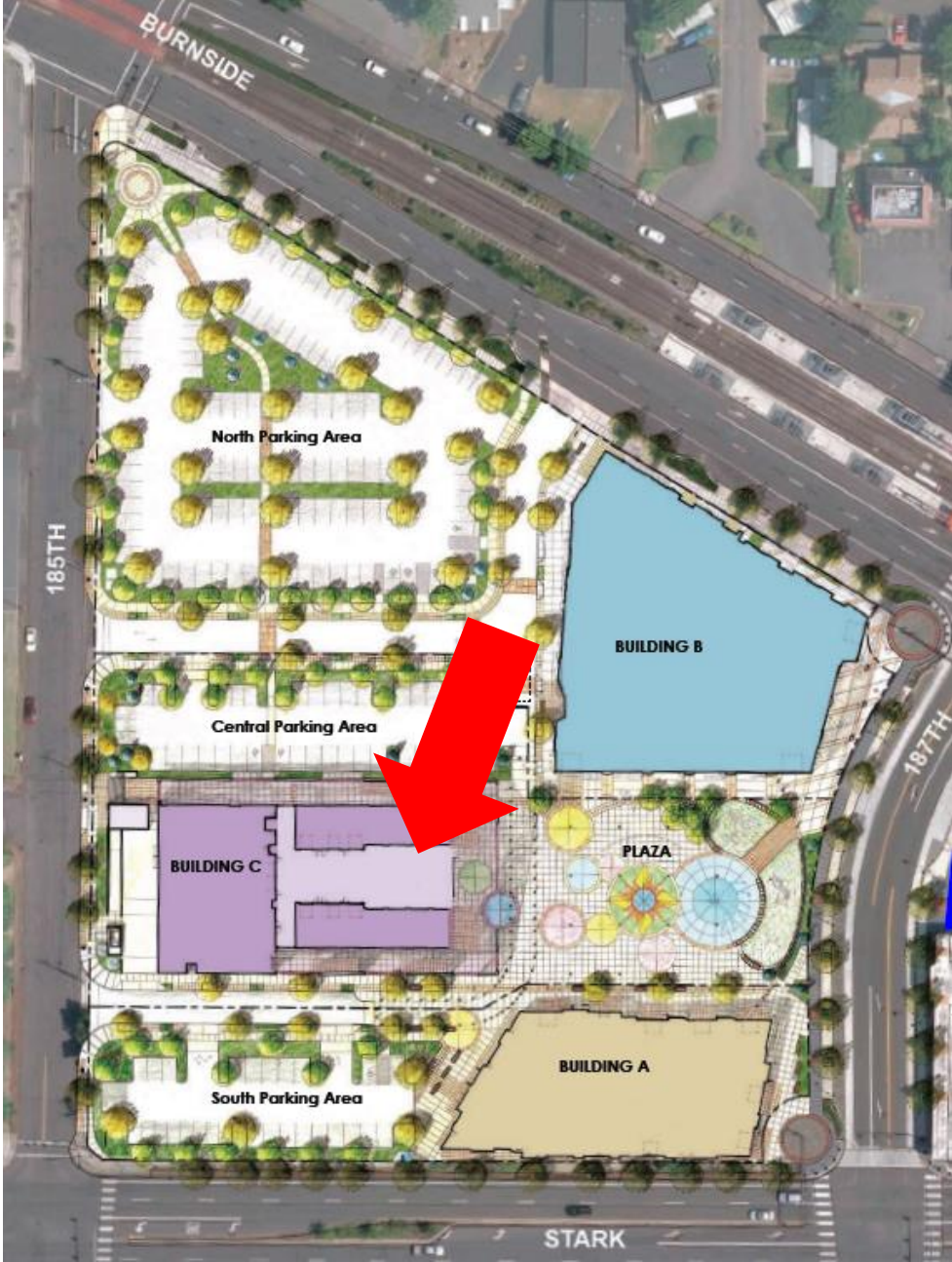
Downtown Rockwood Site Plan