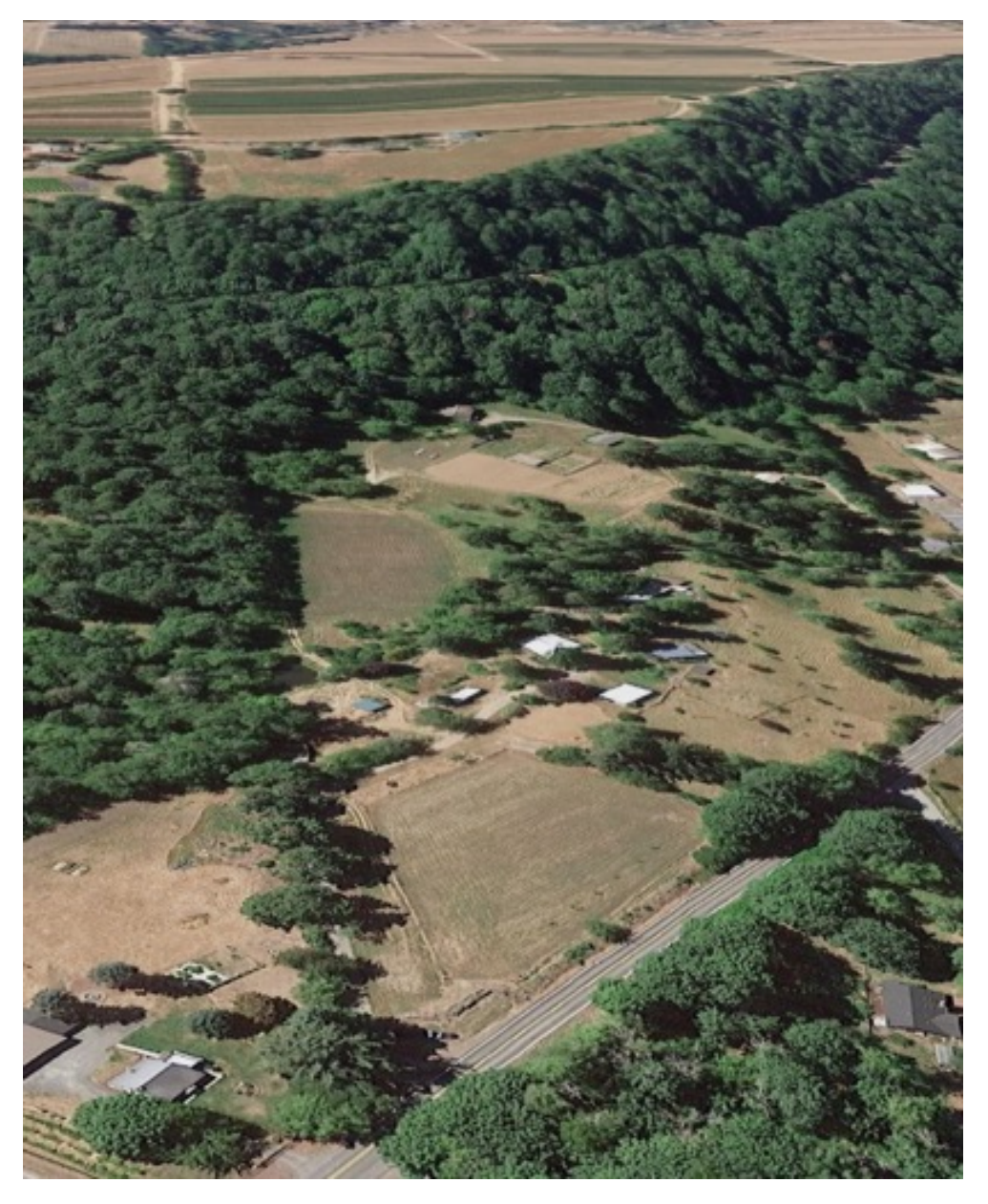
July 2022 – view from SE Lusted Rd looking west.