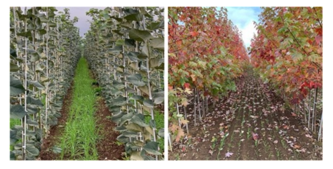
Close-up example of cultivated trees with standard cover-crop planting between rows on Surface Nursery property directly adjacent to the southeast corner of the proposed Filtration Site, October 2020.