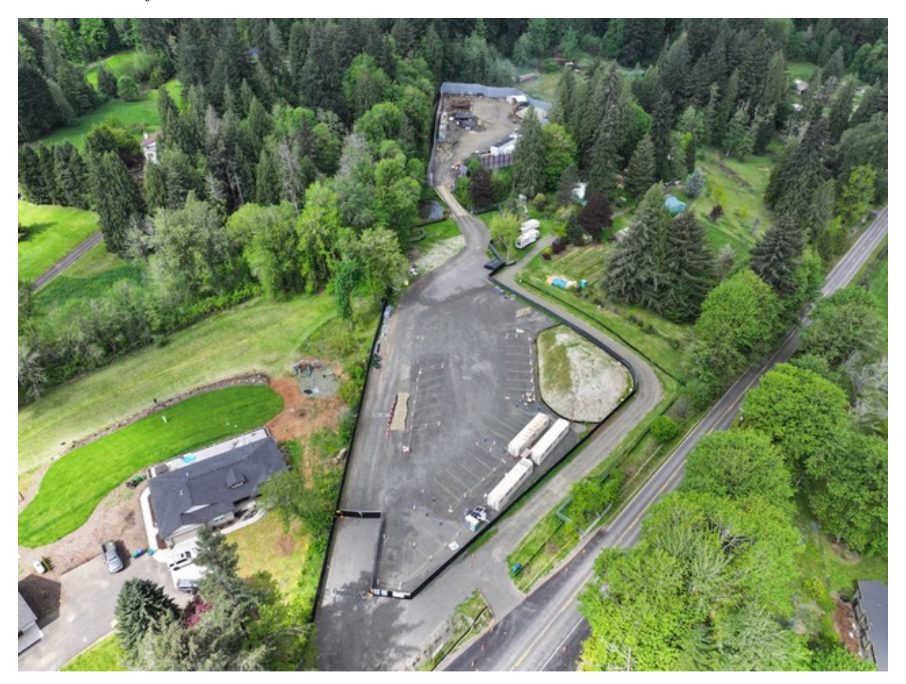
May 2025 – view from SE Lusted Rd looking west.