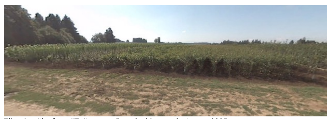
Filtration Site from SE Carpenter Lane looking south, August 2007.

Accurate Pre-Construction Conditions, Prior to 2019 Notice to Remove Nursery Stock