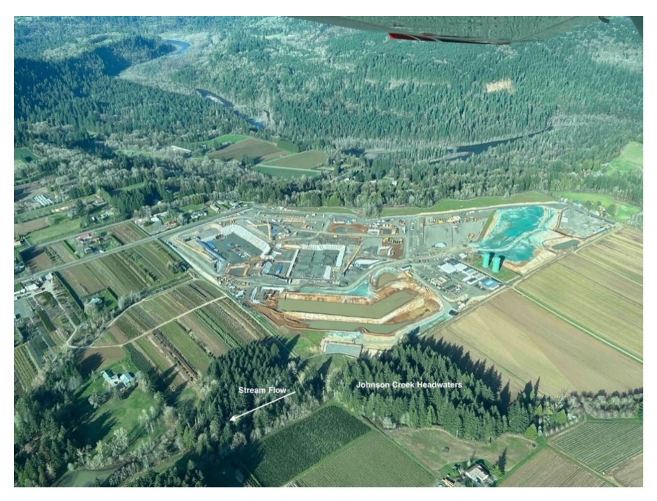
March 2025, Current condition.