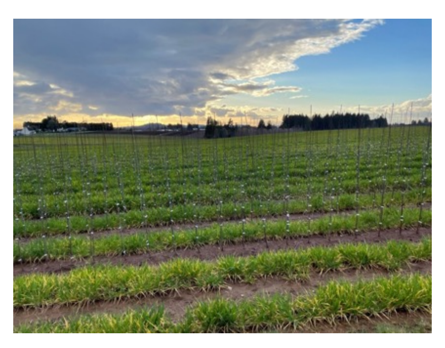
Close-up example of cultivated trees with standard cover-crop planting between rows on Surface Nursery property directly adjacent to proposed Filtration Site facing south toward SE Bluff Road, March 2021.