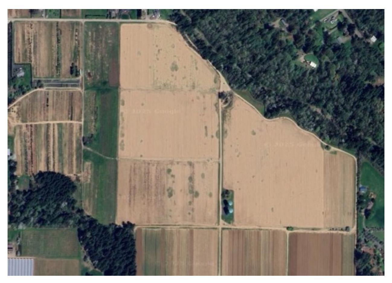
April 2023 – Fallow ground following PWB directive to remove nursery stock