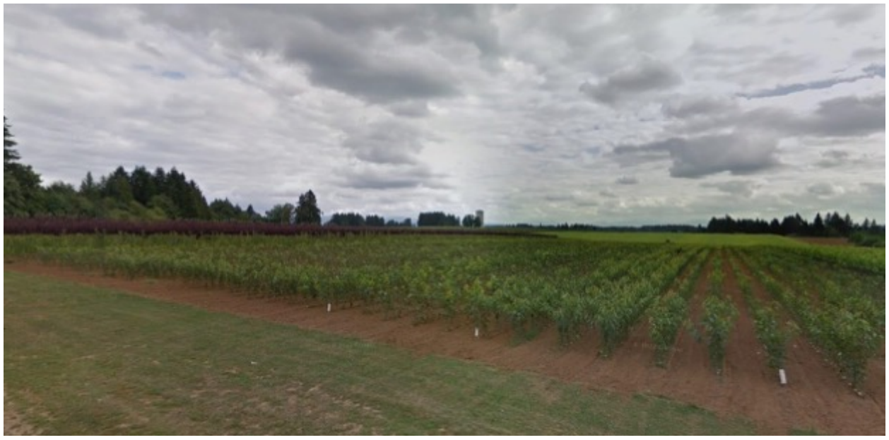
Filtration Site from SE Carpenter Lane looking south, August 2011. In distance, adjacent to Johnson Creek, shows cover crop on land not cultivating nursery stock.