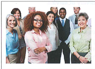
Equity is providing resources so everyone can succeed.

FOR ADDITIONAL INFORMATION: HTTPS://MULTCO.US/PURCHASING/SOCIAL-EQUITY