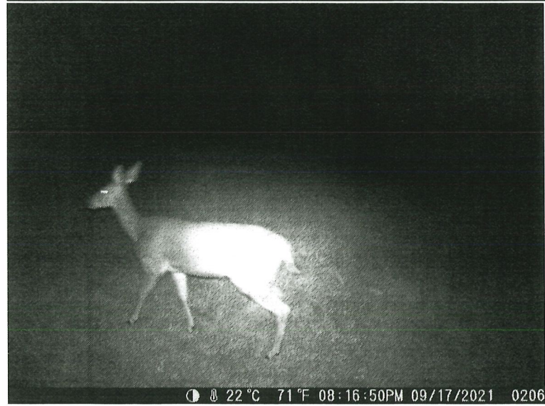
Exhibit 2 to Testimony of Holly Martin\