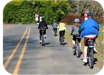
Bicyclists ride here, mostly, in single-file on the narrow roads.

Land use and transportation issues are summarized in tables 1 and 2. The tables include tasks that will be undertaken in a RAP update, as well as examples of comments collected during the outreach activities.