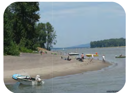
Warrior Point Beach is accessible from Reeder Road.