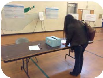
At the second open house questionnaires were collected.