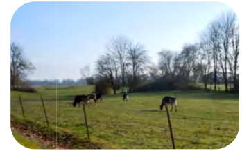
The rural nature is one of the most valued parts of the island.