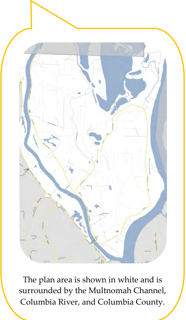
The plan area is shown in white and is surrounded by the Multnomah Channel, Columbia River, and Columbia County.

The area includes about 15,400 acres of land and several thousand additional acres of water. Approximately 11,800 of these acres are designated in the Comprehensive Plan as Exclusive Farm Use (EFU), with the remainder designated as Multiple Use Agriculture (MUA). About 1,300 people live in roughly 450 units on the island and 200 units between Multnomah Channel and Hwy 30.