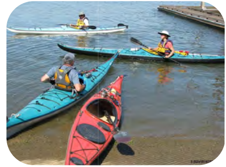
Kayakers use Sauvie Island as a launching point.