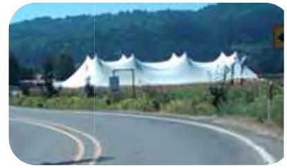
A large farm tent in a field.