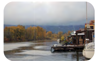
A marina during the fall.