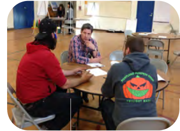
Open house attendees spoke with staff members.

Additionally, Multnomah County staff attended the Sauvie Island Community Fair and annual meeting for SICA on April 18, 2013 (Appendix J). Four questionnaires were collected at the event and staff spoke with several residents and visitors about the process.