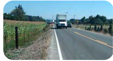
Narrow shoulders on the roads are one issue raised by all road users.

Between February and April 2013, Multnomah County conducted extensive outreach as part of the Sauvie Island/Multnomah Channel scoping process. Local residents, businesses, government agencies, community organizations, and frequent visitors were involved with this scoping process through two open houses, two printed and online questionnaires, two stakeholder meetings, and two focus group meetings. Additionally, Multnomah County staff attended the Sauvie Island Community Fair and a Sauvie Island Community Association meeting, as well as conducting a phone interview with the Grand Ronde Tribe.