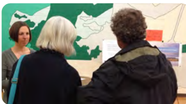
Attendees added issues to maps and spoke with staff members.

On March 5, 2013, two stakeholder meetings were held at the CH2M HILL downtown Portland offices to collect issues, questions, concerns, and visions from key stakeholders. Stakeholders were identified from their interest in the last planning process in 1997, as well as their current interactions and communication with the County. The list of invitees was extended to other stakeholders that were assumed to have strong opinions about the study (appendices A and B). Approximately 17 government agencies attended one meeting and five organizations and non-government stakeholders attended the other meeting.