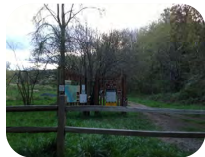
Wapato State Park was mentioned as popular destination