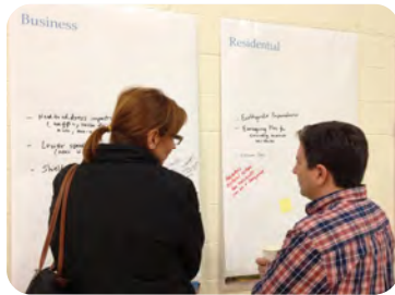
Visions were collected on the walls and questionnaires.

outlets throughout the Metro region. Additionally, information on the study was advertised through the Sauvie Island Community Association’s (SICA) website and meetings.